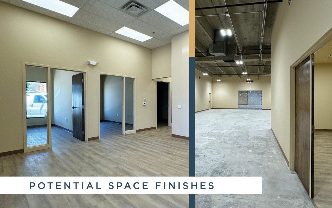
POTENTIAL SPACE FINISHES