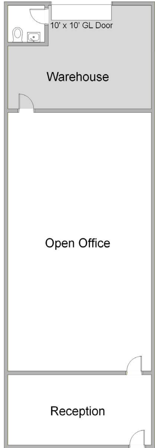
*Floorplans Not to Scale