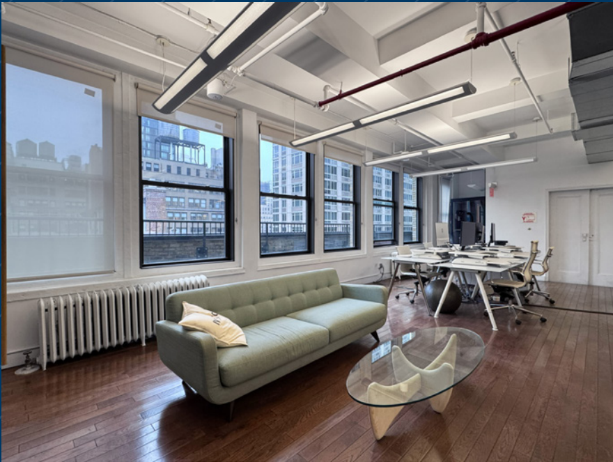
Furniture shown for layout concept only