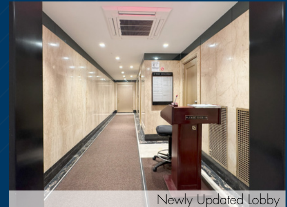
Newly Updated Lobby

Great Transit Access - One Block from Bryant Park