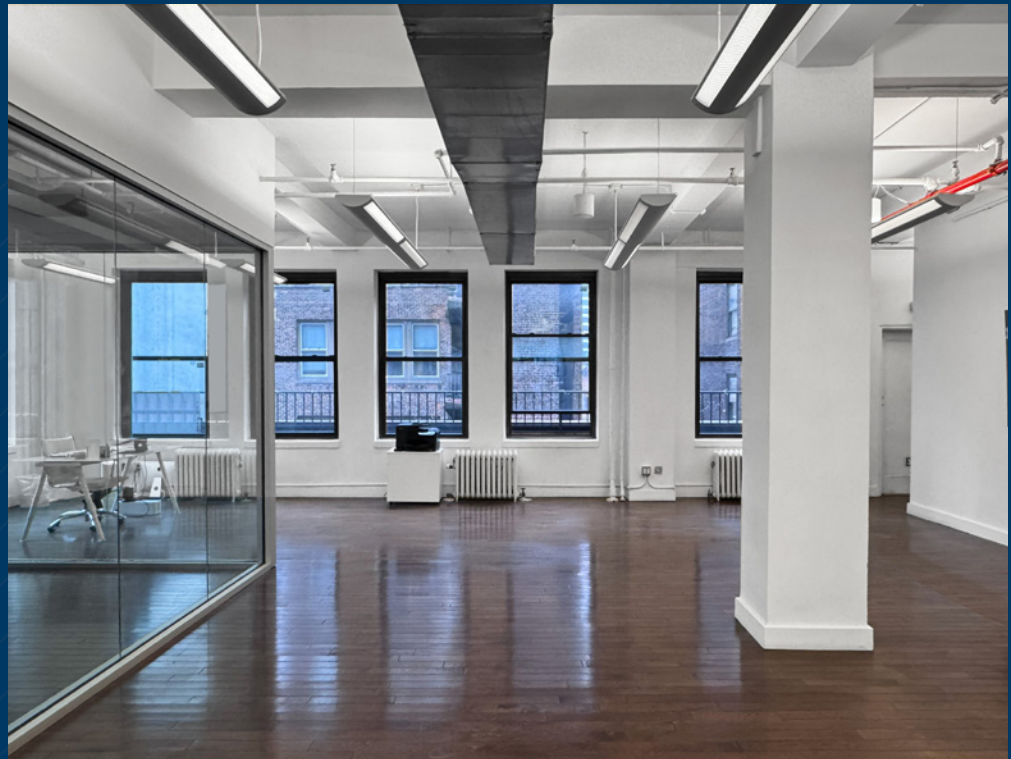
12A Floor - Furniture shown for layout concept only