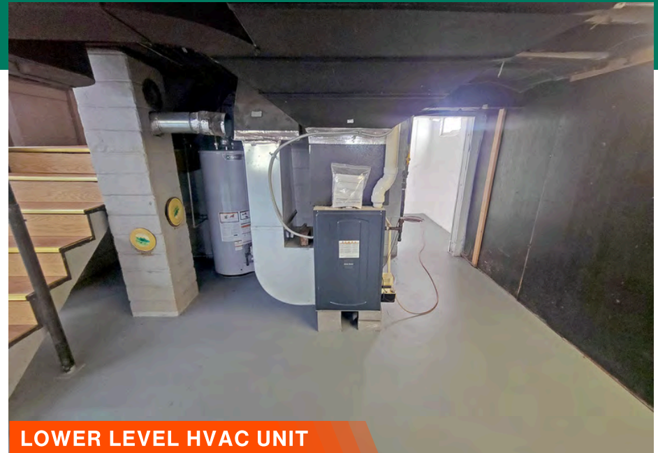
LOWER LEVEL HVAC UNIT