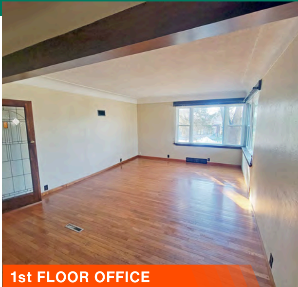
1st FLOOR OFFICE

Well-maintained 2,000 SF two-story office building featuring 2 offices, reception, conference room, restroom, and full kitchen on the main level. The second floor offers 3 offices and a restroom. Lower level includes storage, wash basin, sump pump, and mechanicals. Updates include HVAC (3 years old), water heater (1 year old), and roof replaced in 2012.