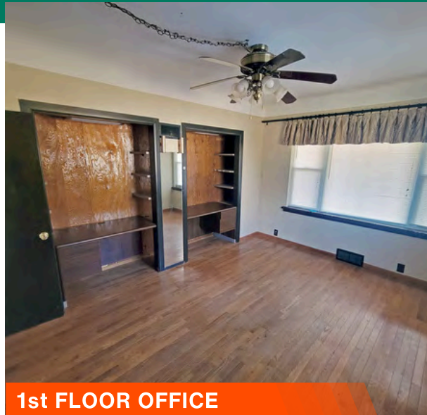
1st FLOOR OFFICE