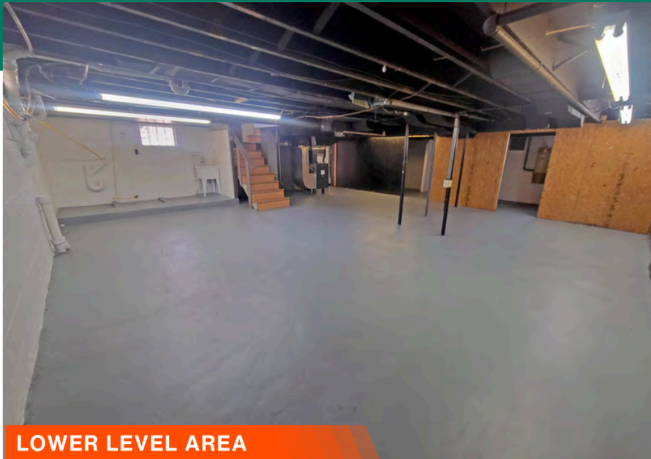
LOWER LEVEL AREA