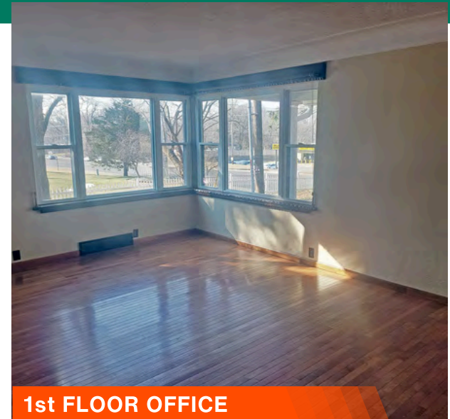
1st FLOOR OFFICE