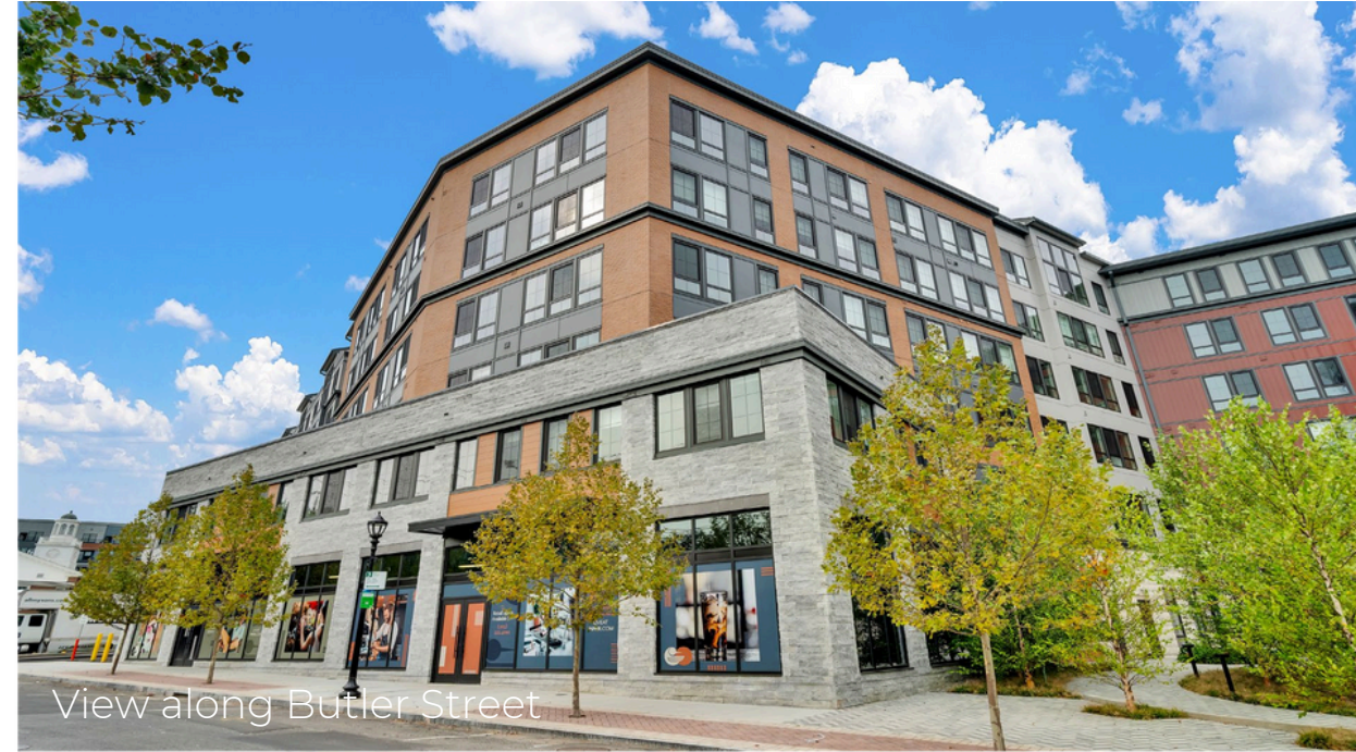
View along Butler Street