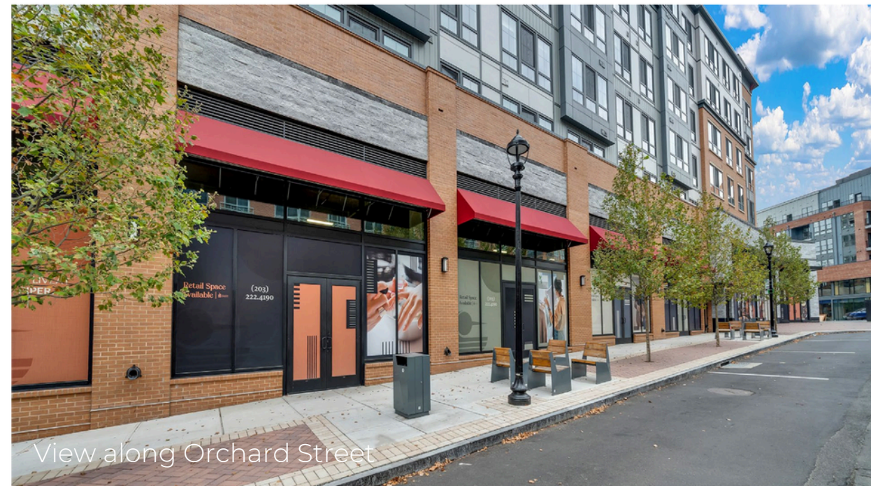
View along Orchard Street