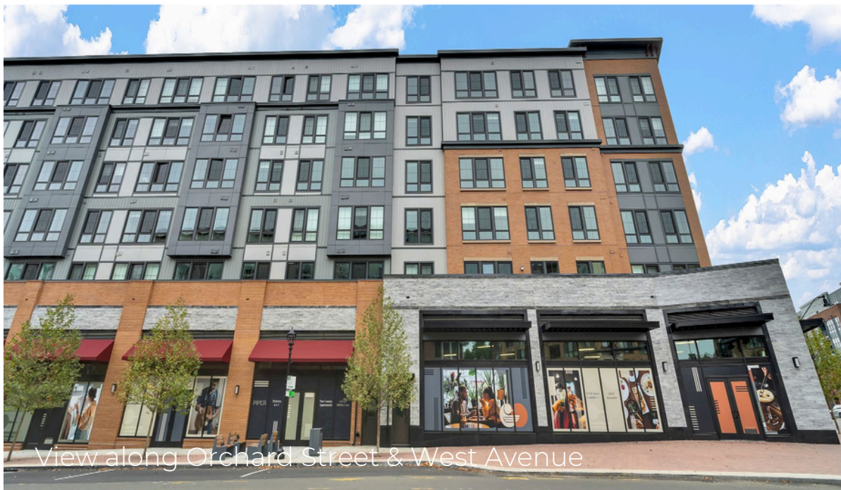
View along Orchard Street & West Avenue