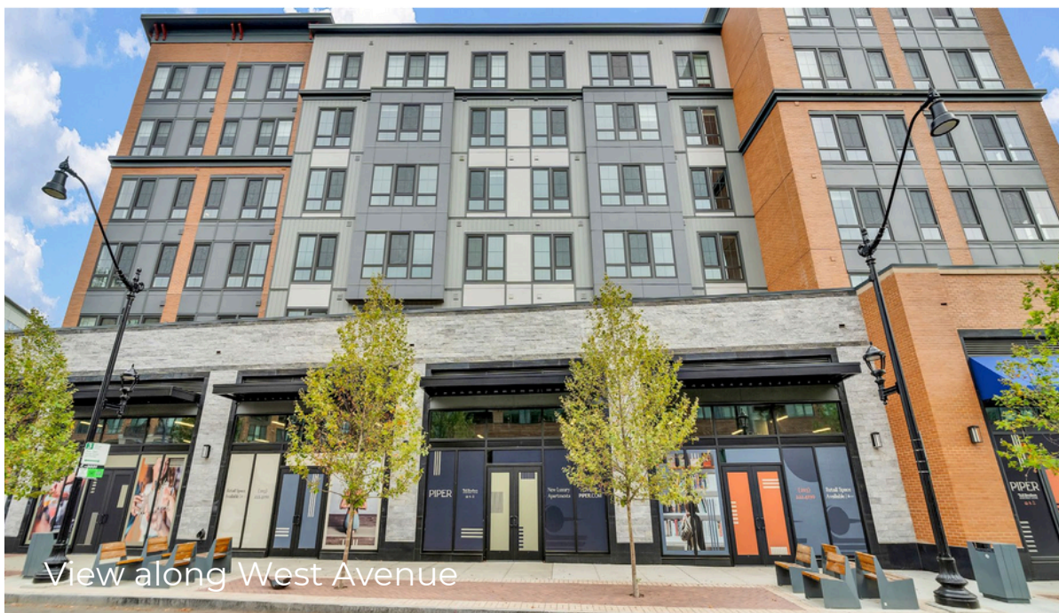
View along West Avenue