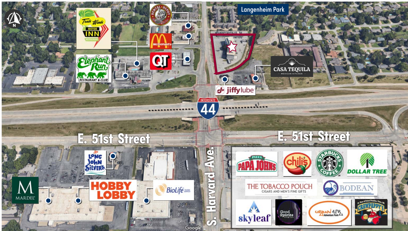
Greater Tulsa Area Map