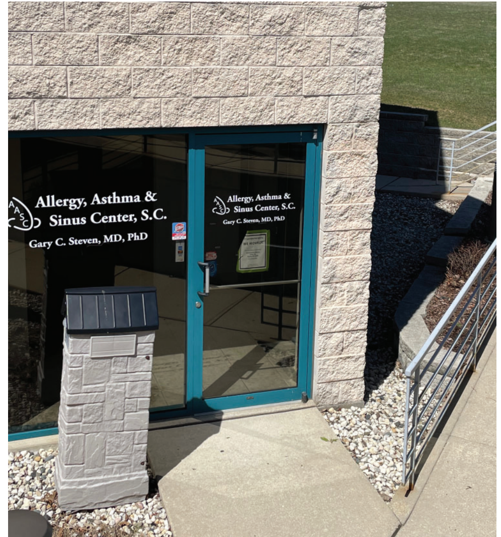
Exterior of Space Available