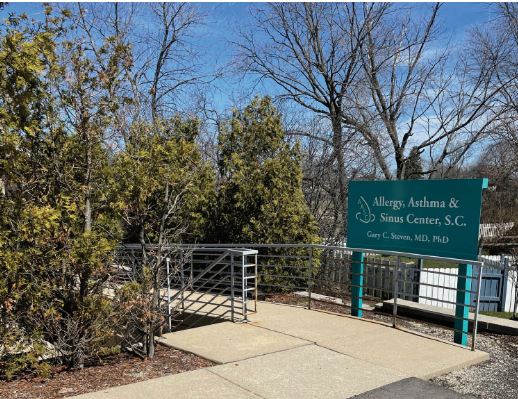
New Tenant Sign Available