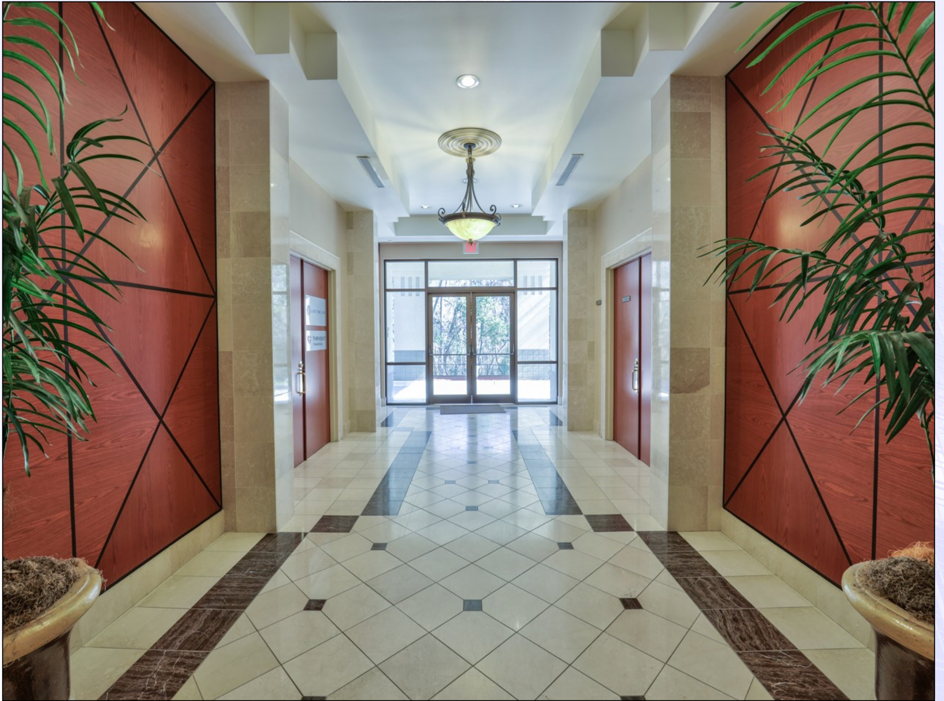
Main Entrance Lobby