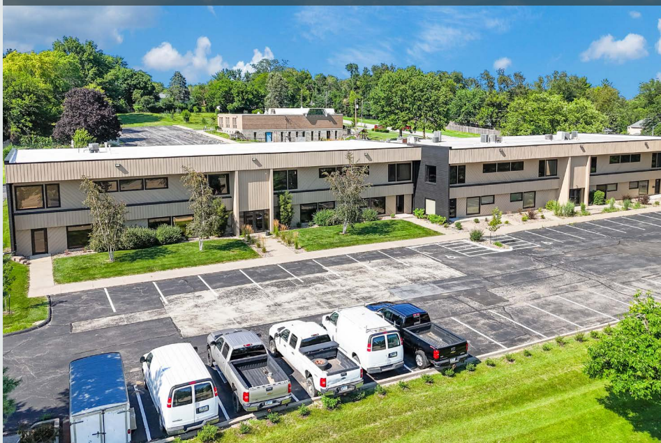
Lower Level - South Side