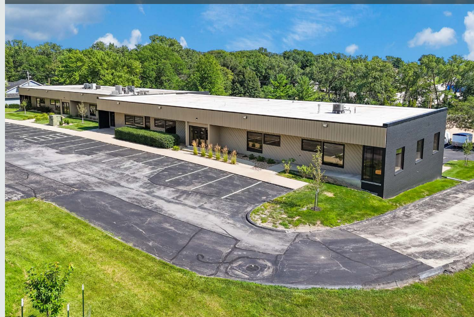
Upper Level - North Side