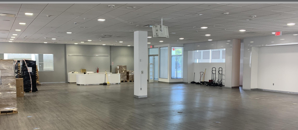
Interior facing front door