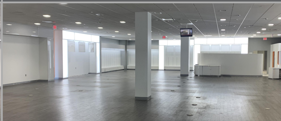
Interior facing east

30 Glen Cove Road - Greenvale NY 7,200 square feet Former ULTA