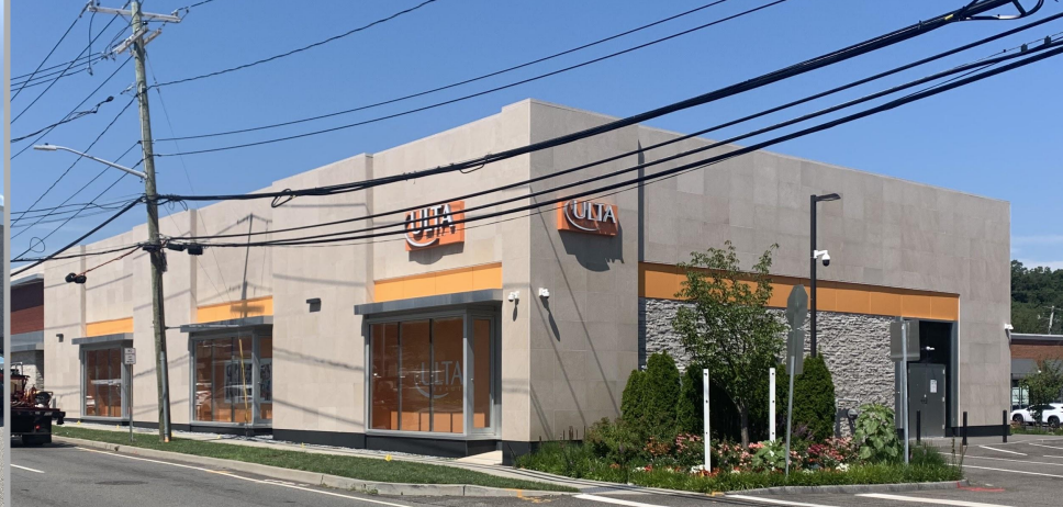
View from Northern Blvd