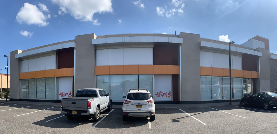
View from parking lot