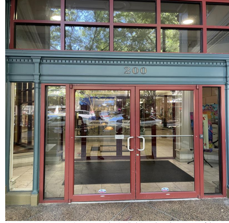
No warranty or representation, expressed or implied, is made to the accuracy of the information contained herein, and the same is submitted subject to errors, omissions, change of price, rental or other conditions, imposed by the principles.