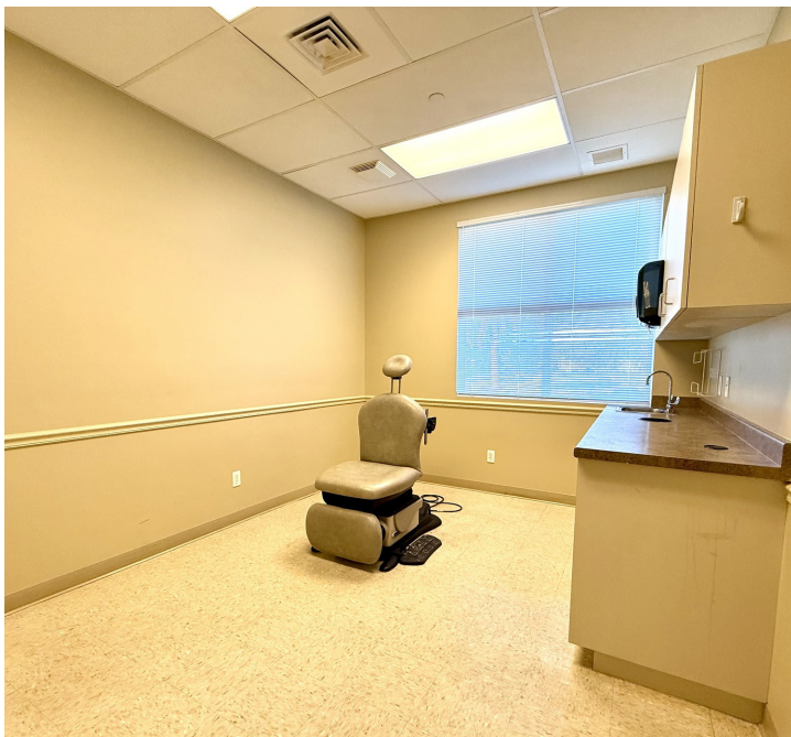
Typical Patient Exam Room