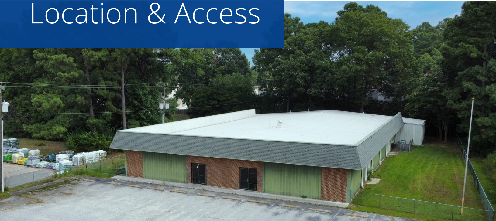
Side road entrance and front entrance accesibility