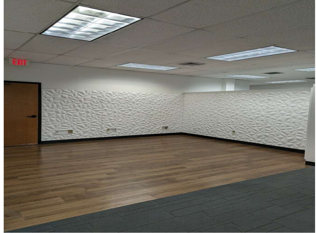
Textured wall at Main Entry