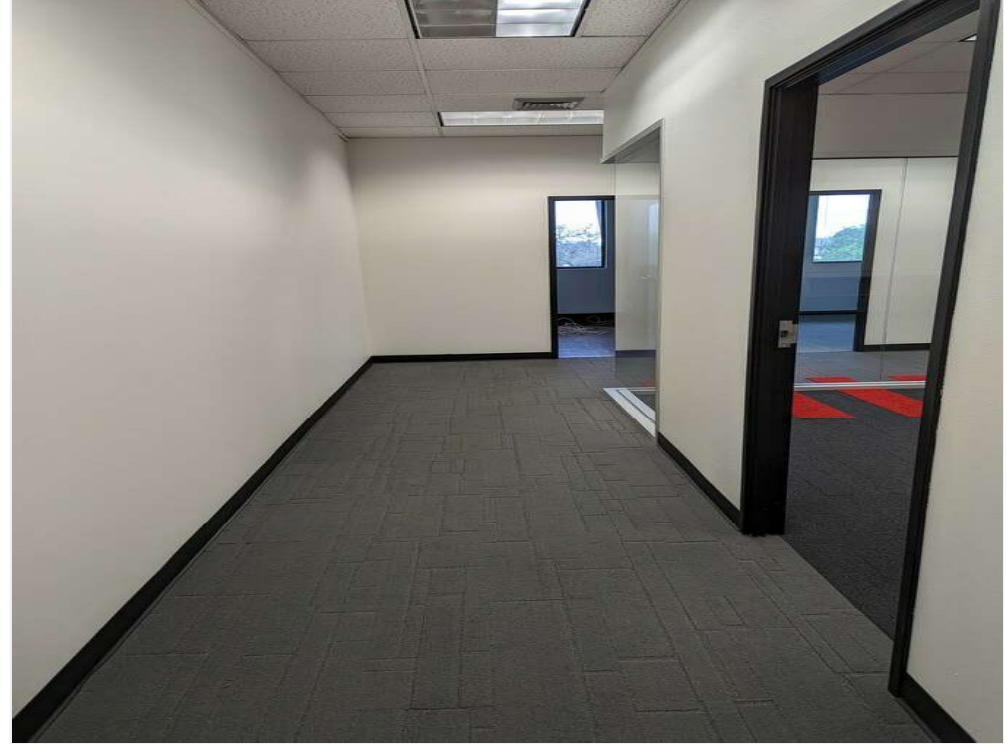
Entering at 3rd door to suite next to conference room