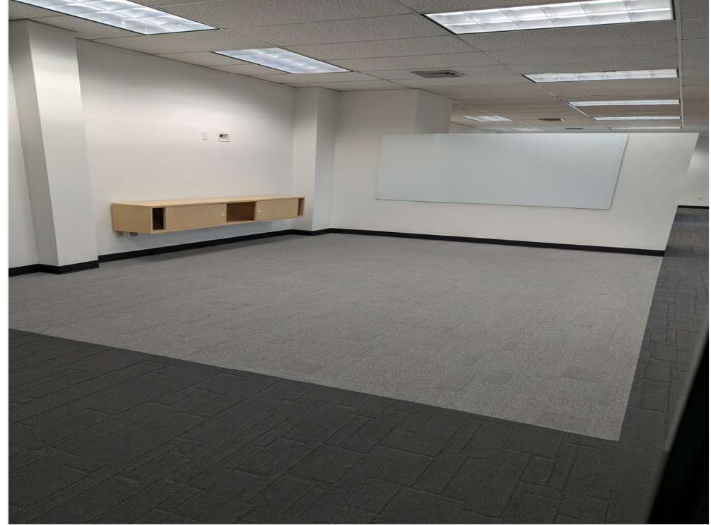
Open Work Space