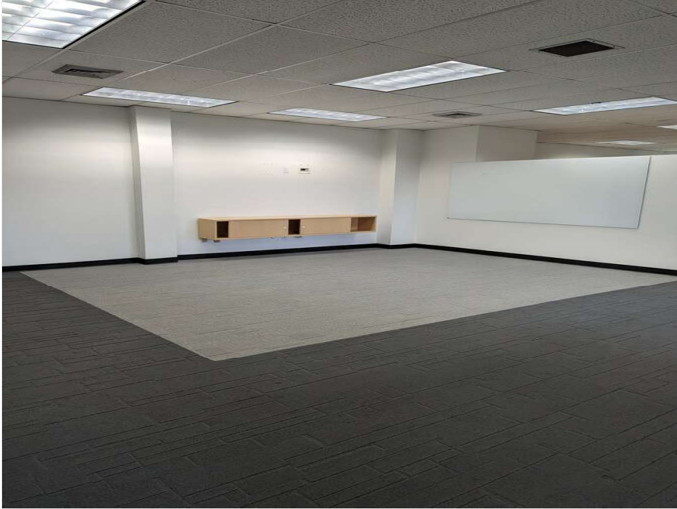
Open Work Space