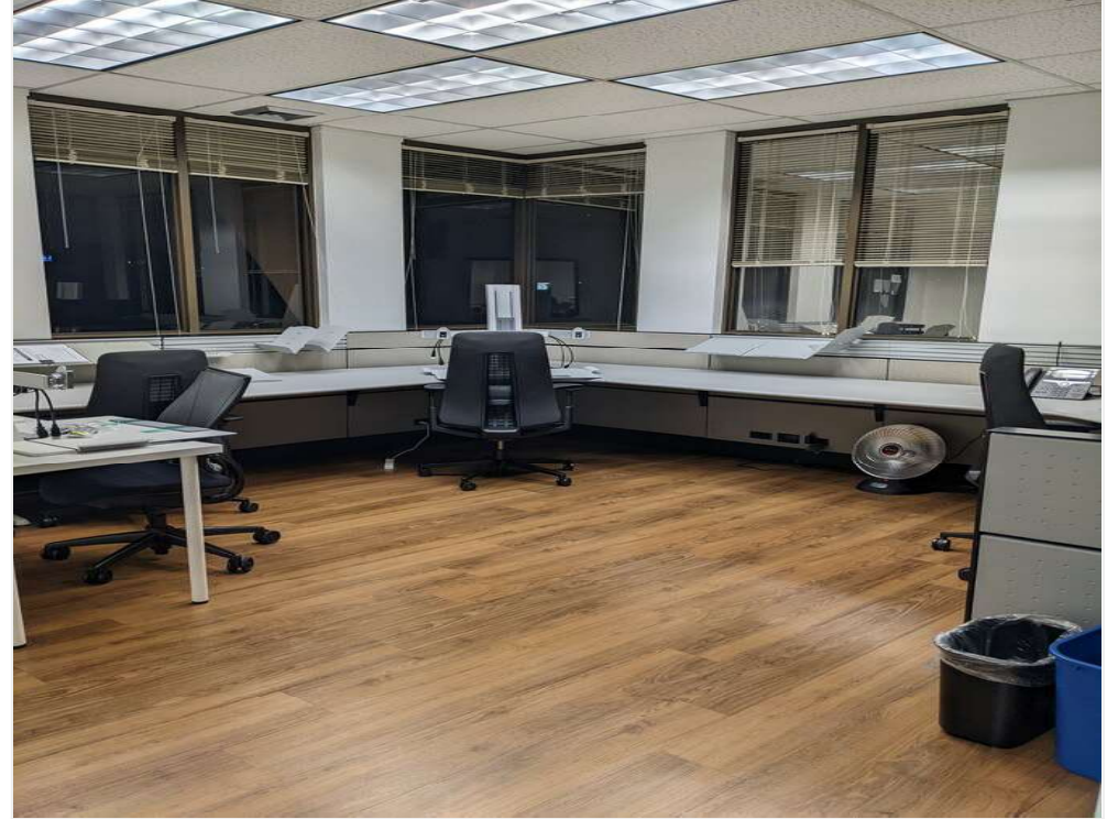
2nd Large Corner Office shows laminate floors.