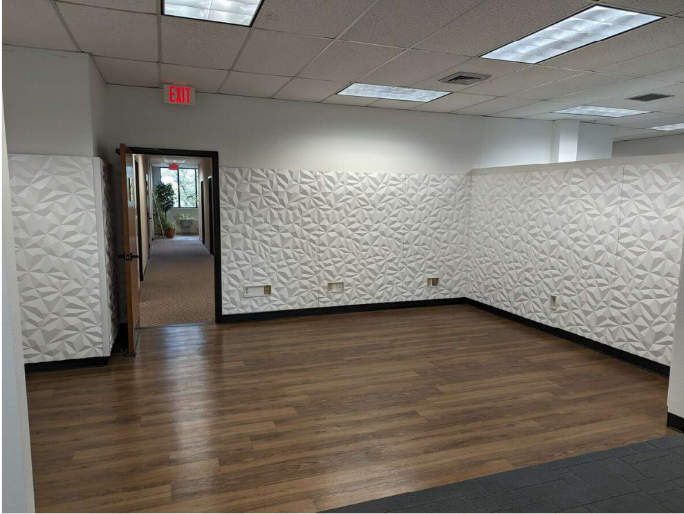
Main Entry into Suite