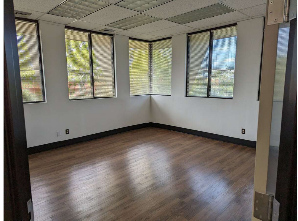
Large Corner Office