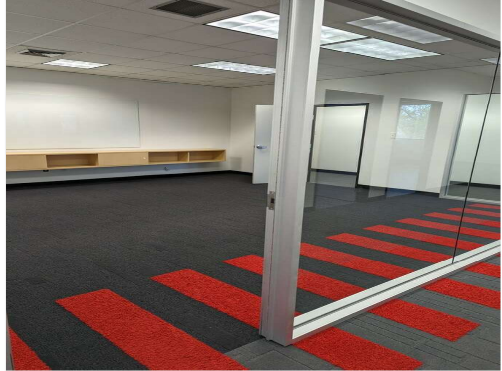
Conference Room with glass walls