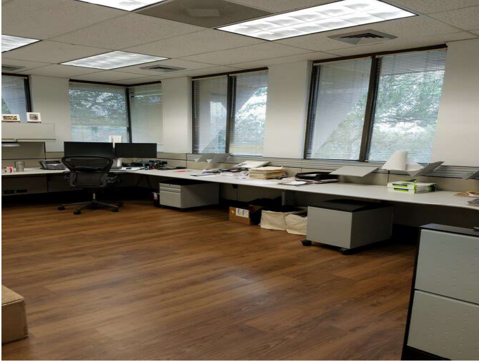
3rd Corner office showing large work space