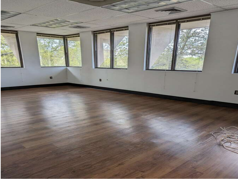
1st Corner Office-Vacant