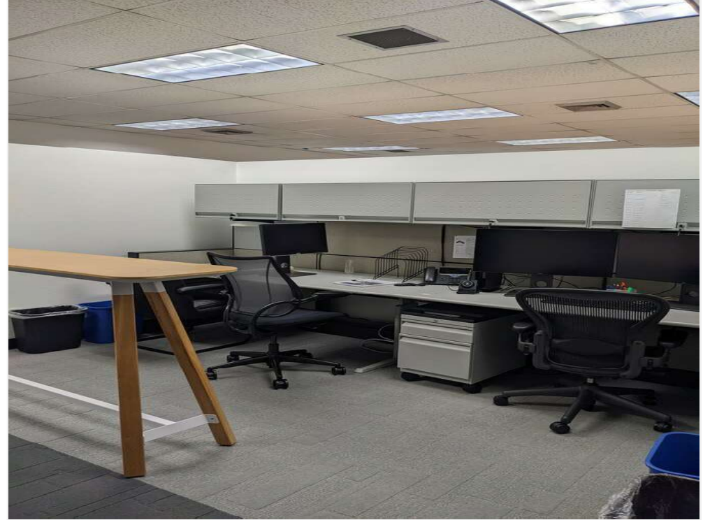
Work Space for 2 folks