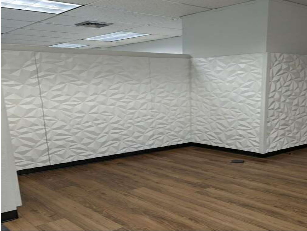
Textured wall at Main Entry