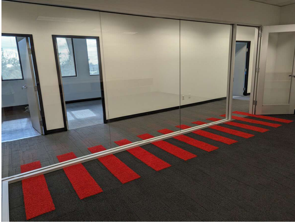
Glass Wall in Conference Room