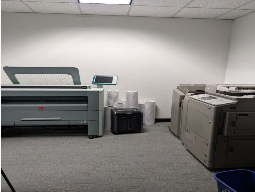
Copier /Storage Room