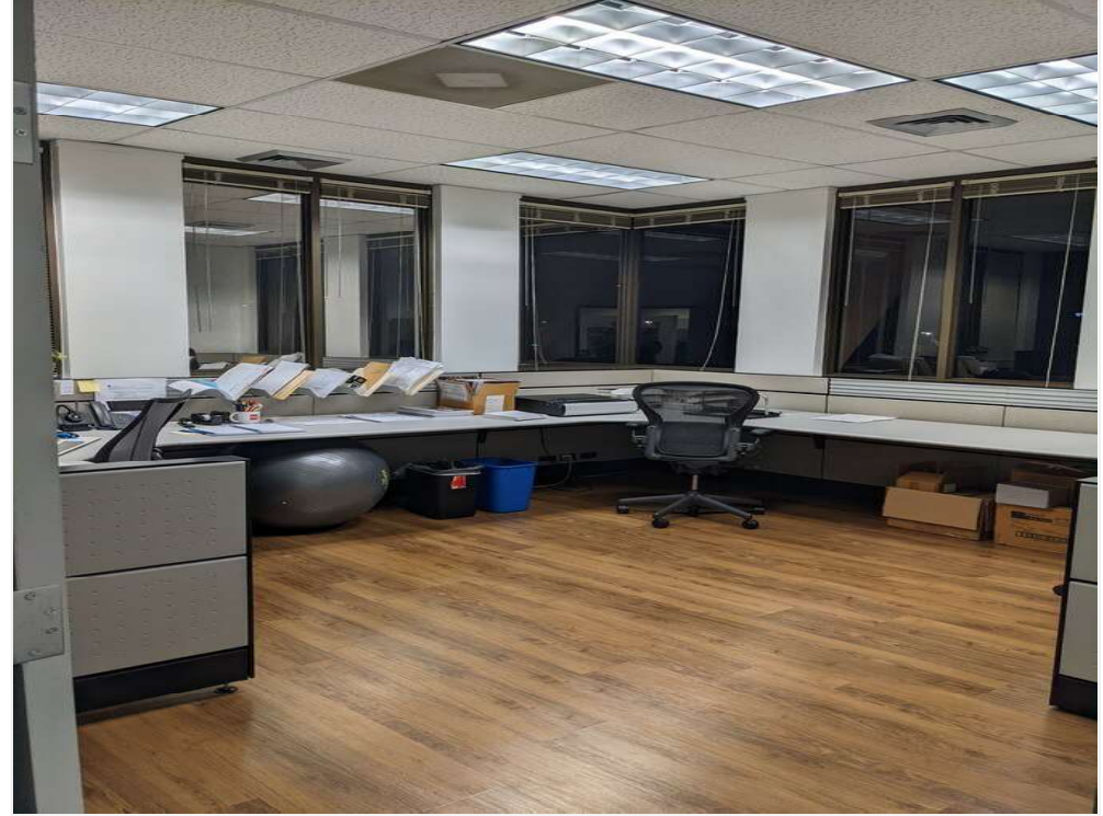
Corner Offices have room for 3 folks