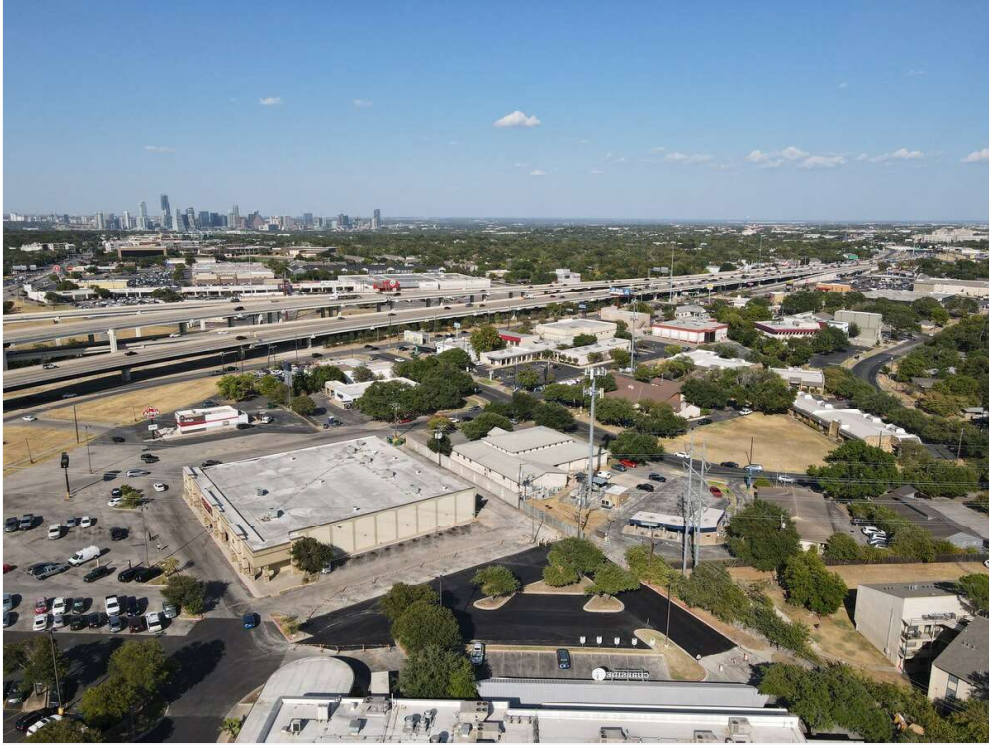
Central Market at the bottom of the photo