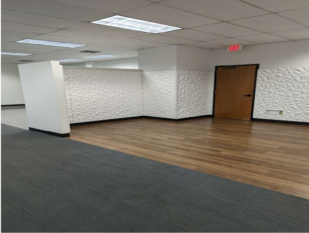
Main Entry with Textured walls