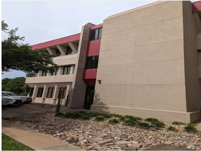
Right Side of Building (E)

2222 Western Trails Blvd, Austin, TX 78745