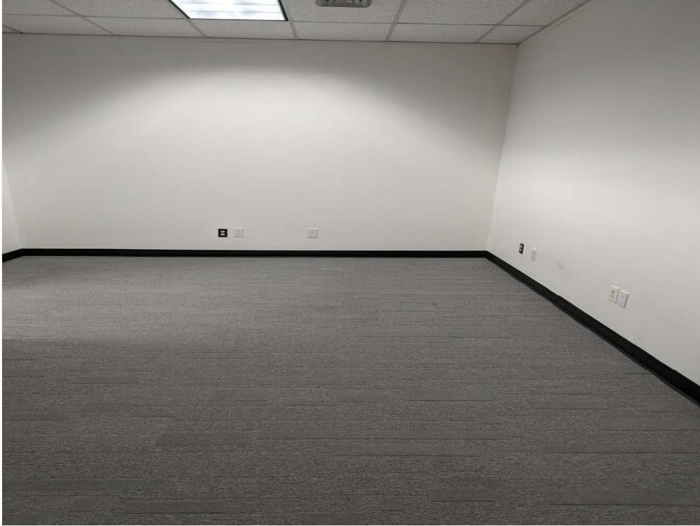
Copier Storage Room