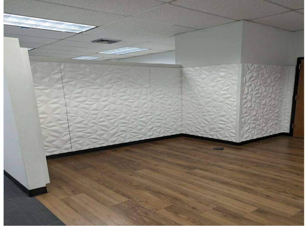
Textured wall at main entry