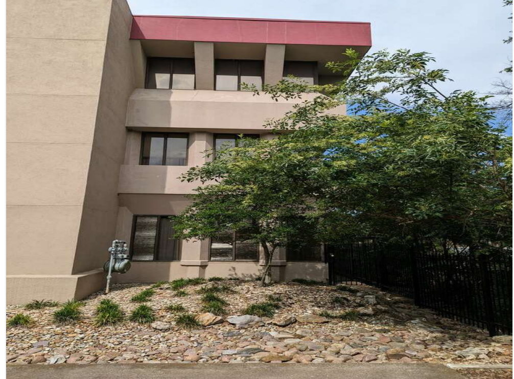
Right Side towards Back of Building