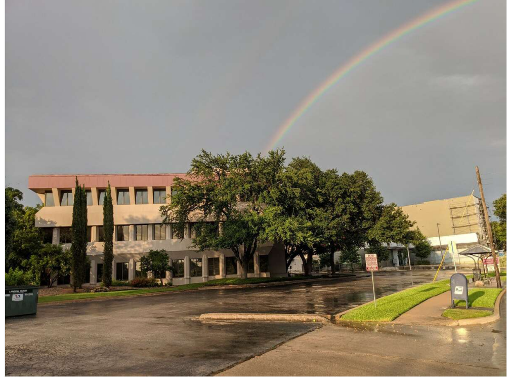
Our Building at the end of the Rainbow