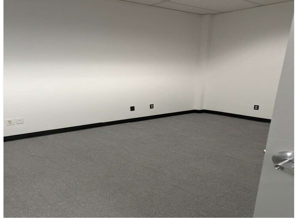
Copier Storage Room