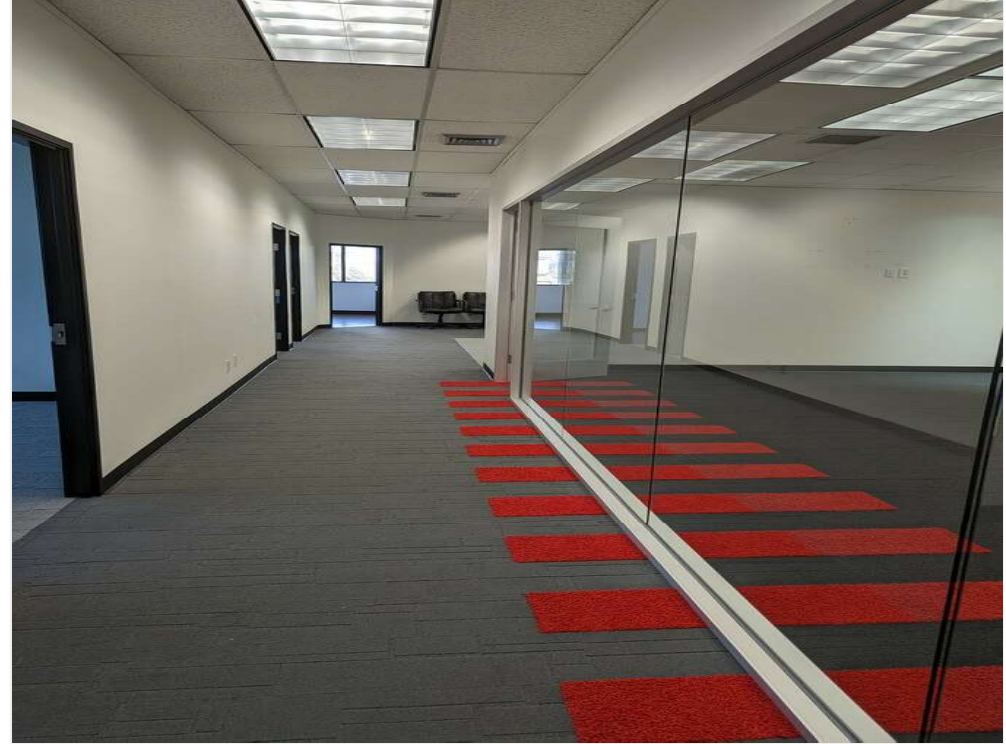
Hall way at Conference room to offices