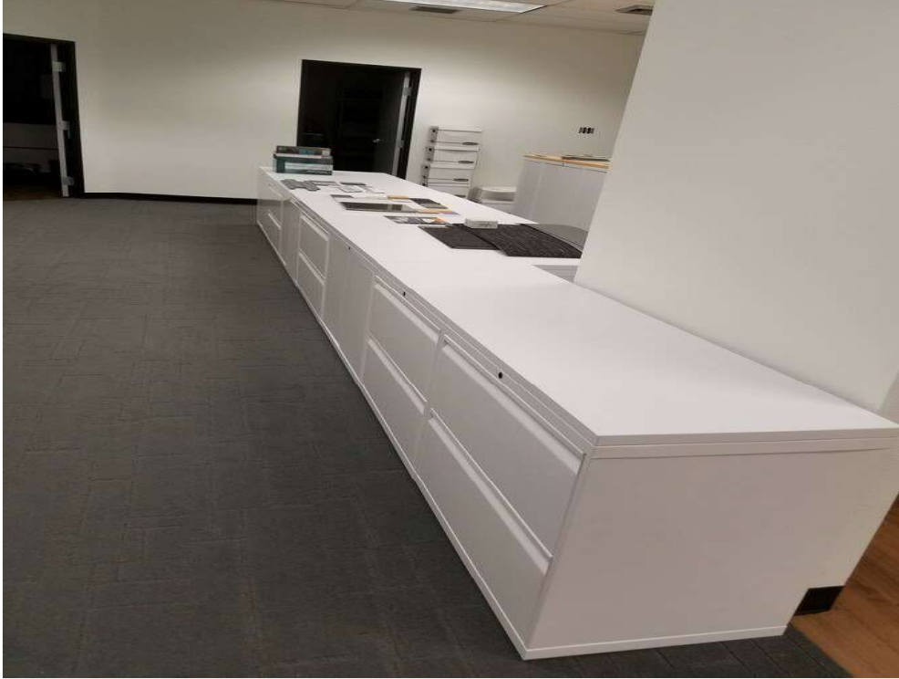
Display Area/Open Work Space area