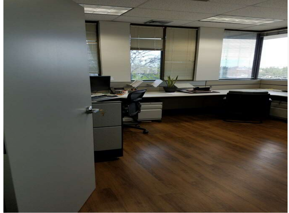
3rd Corner Office showing large work space