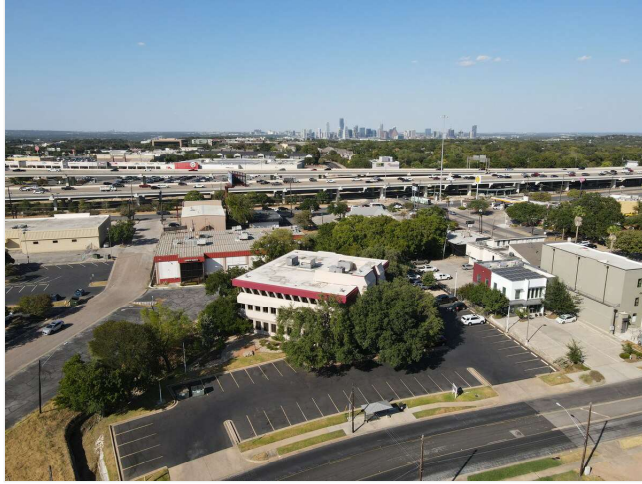
2222 Western Trails Blvd., Western Trails Professional Building

2222 Western Trails Blvd, Austin, TX 78745