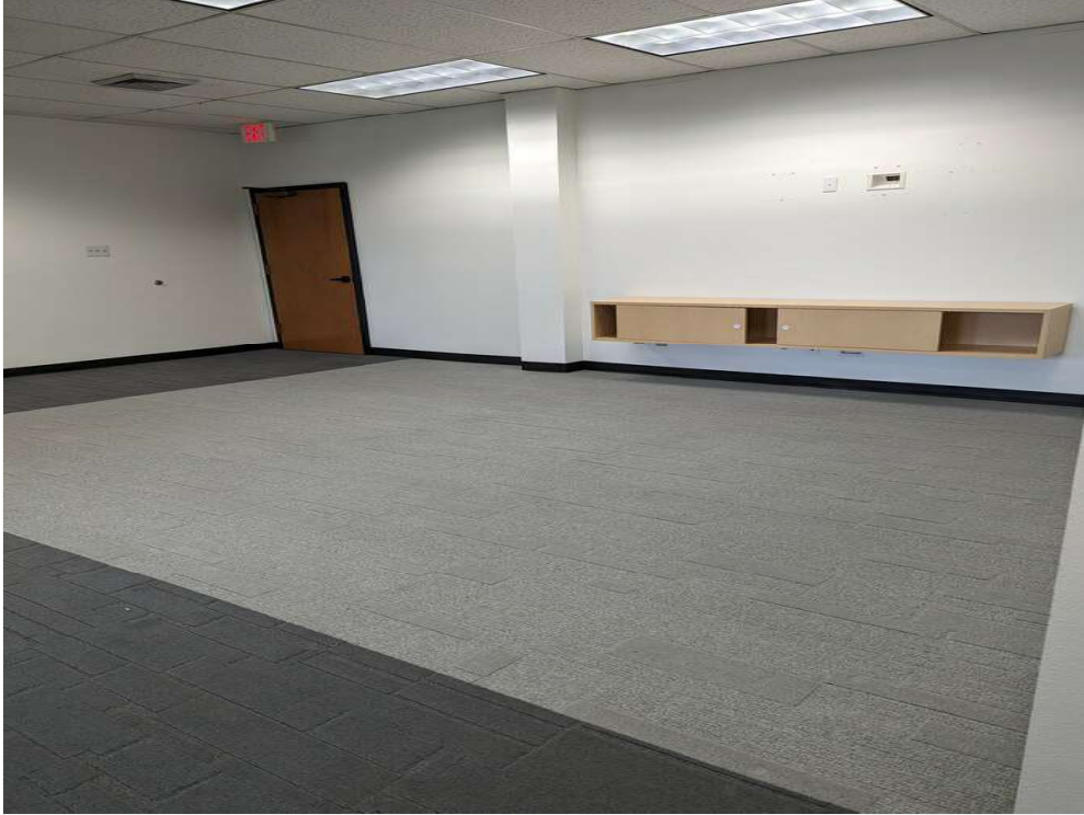
Open Work Space showing another Door exist