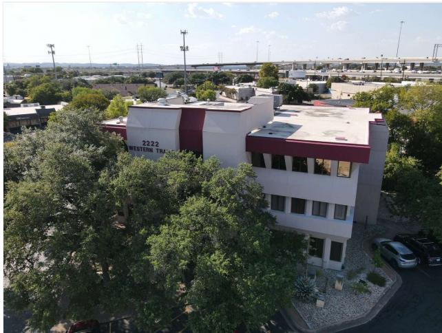
Western Trails Professional Building