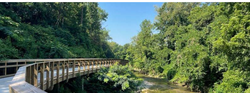
LITTLE SUGAR CREEK GREENWAY