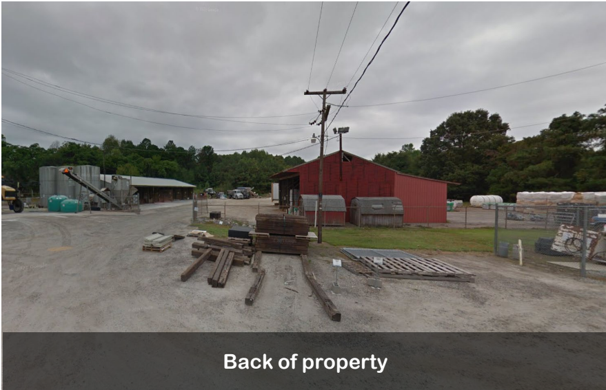
Back of property