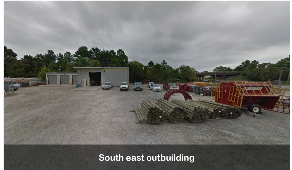
South east outbuilding