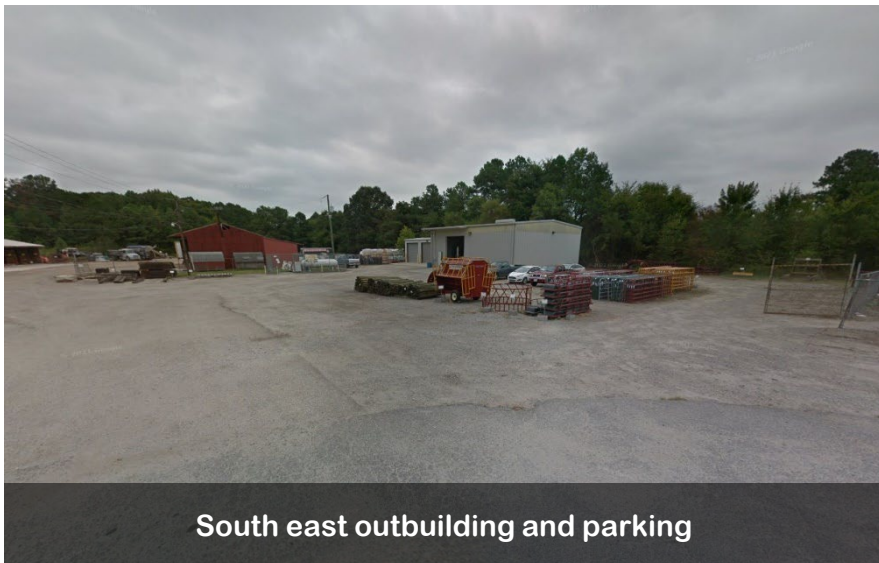
South east outbuilding and parking