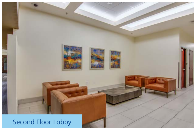
Second Floor Lobby