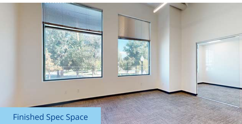
Finished Spec Space