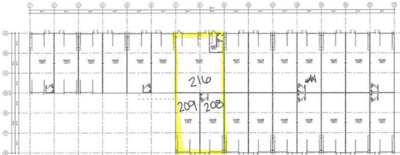
2) Marketing Plan, Condos 4

PLANFORCE ARCHITECTURE + DESIGN 21 Glenwood Avenue Suite 330 Minneapolis, Minnesota 612.541.9950 planforcegroup.com