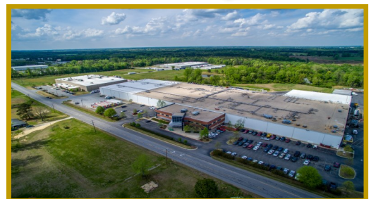
Exit 168 at Interstate 95