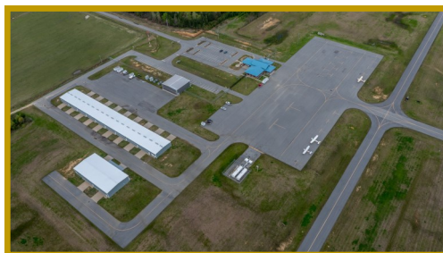
Halifax Northampton Regional Airport (IXA)