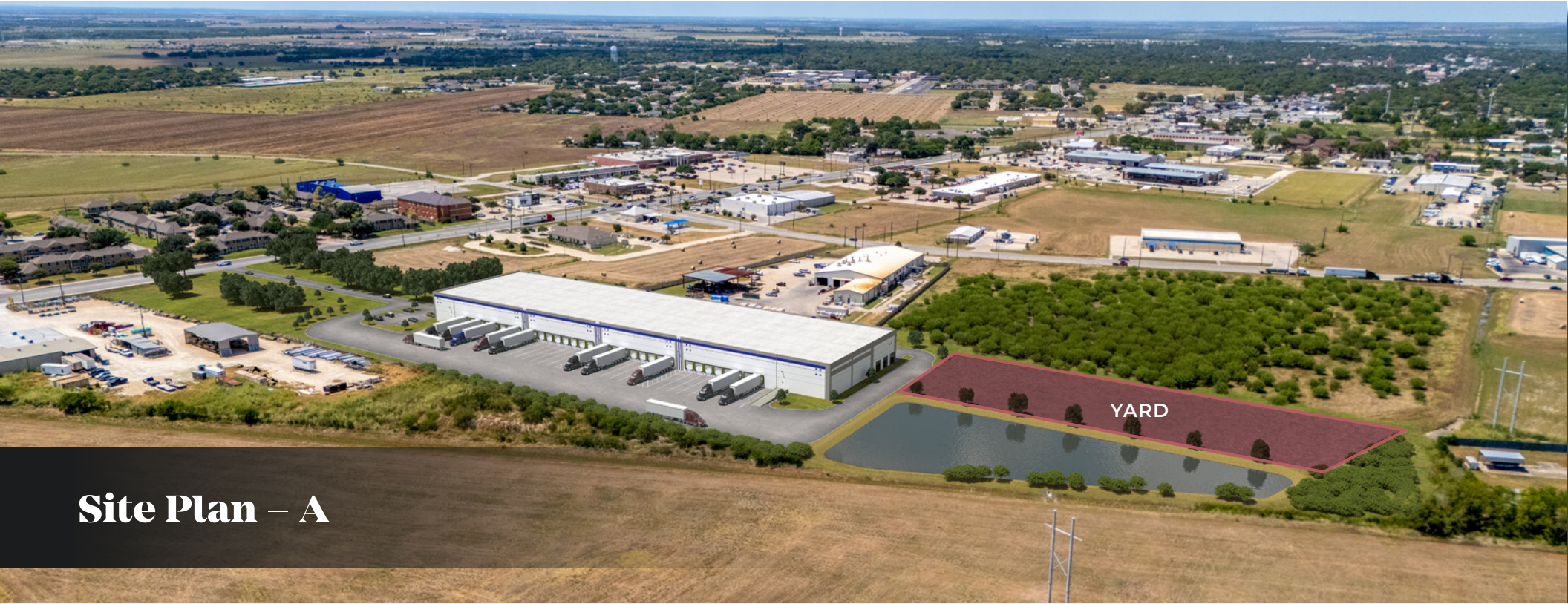
Site Plan – A