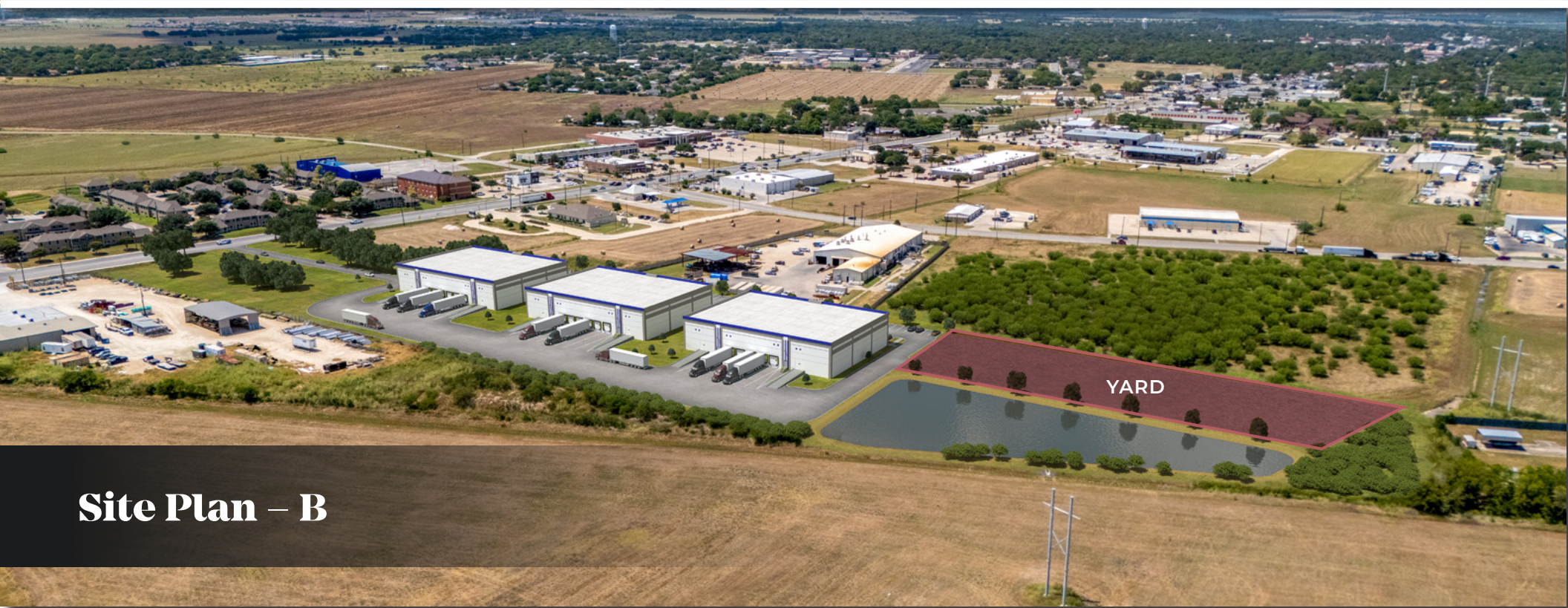
Site Plan – B