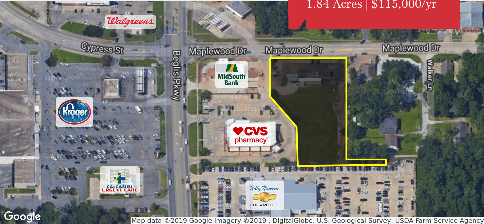
Map data ©2019 Google Imagery ©2019, DigitalGlobe, U.S. Geological Survey, USDA Farm Service Agency