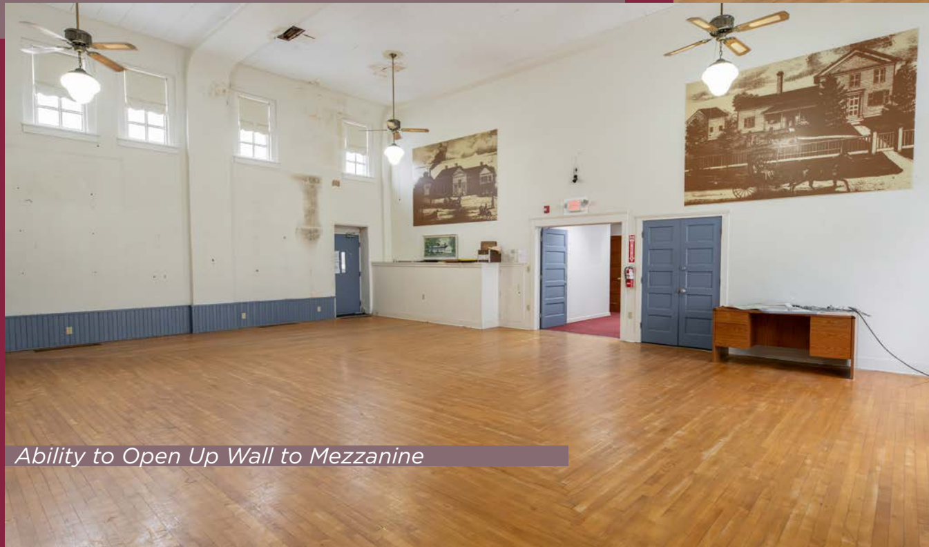
Ability to Open Up Wall to Mezzanine