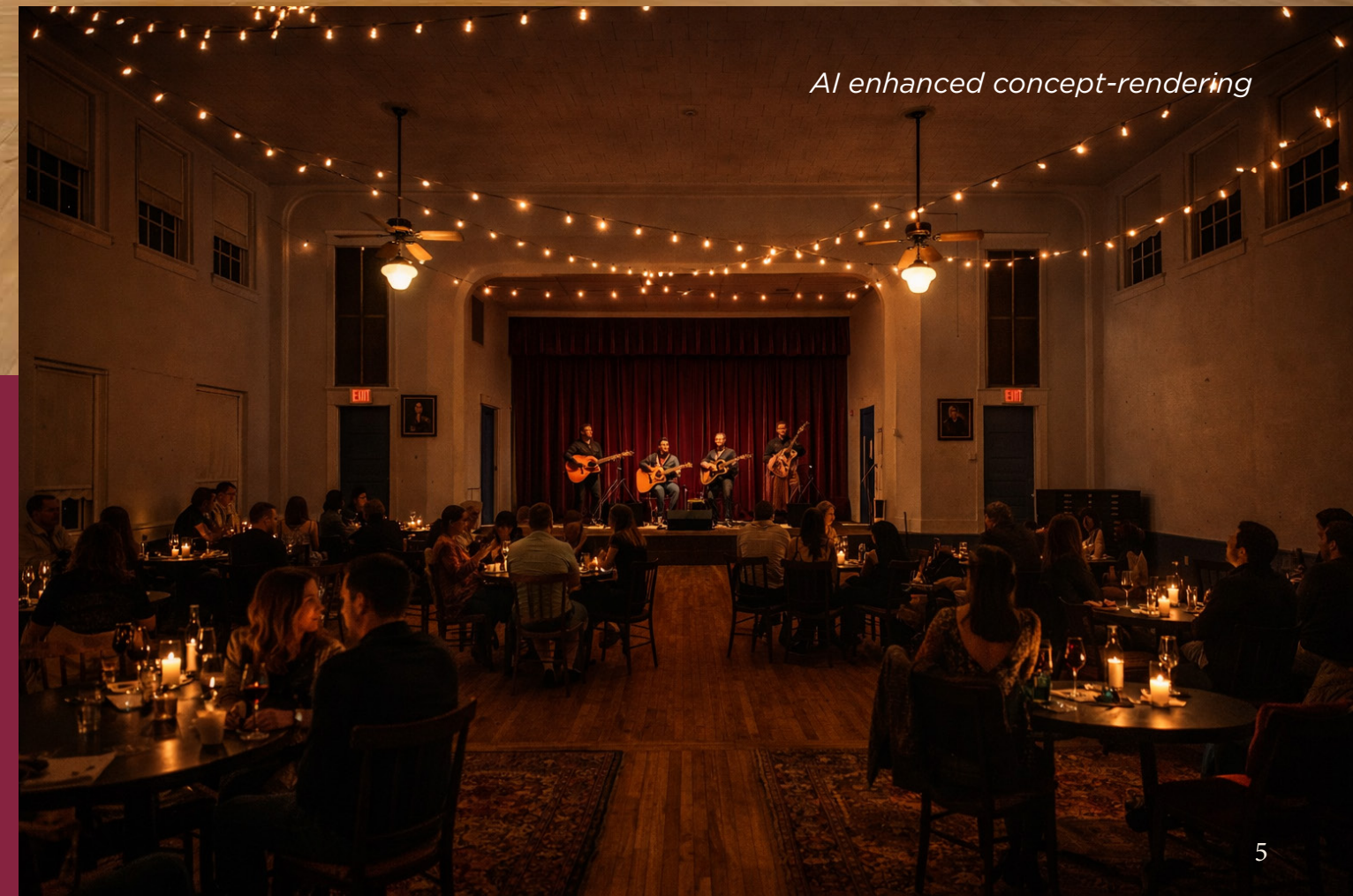
AI enhanced concept-rendering