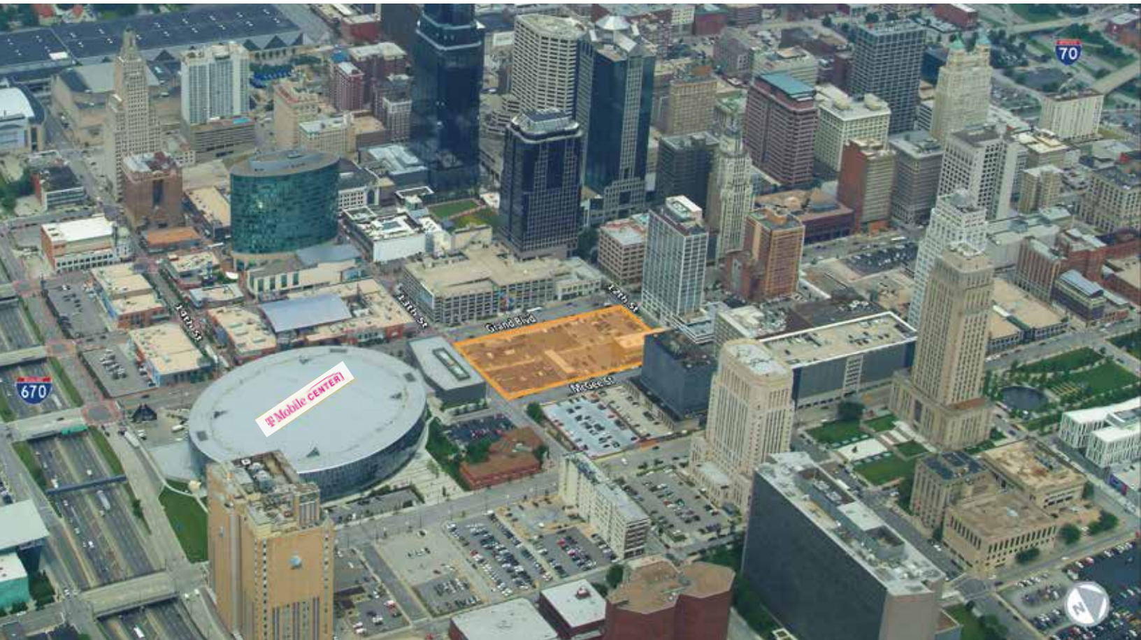
Views from the 3rd Floor