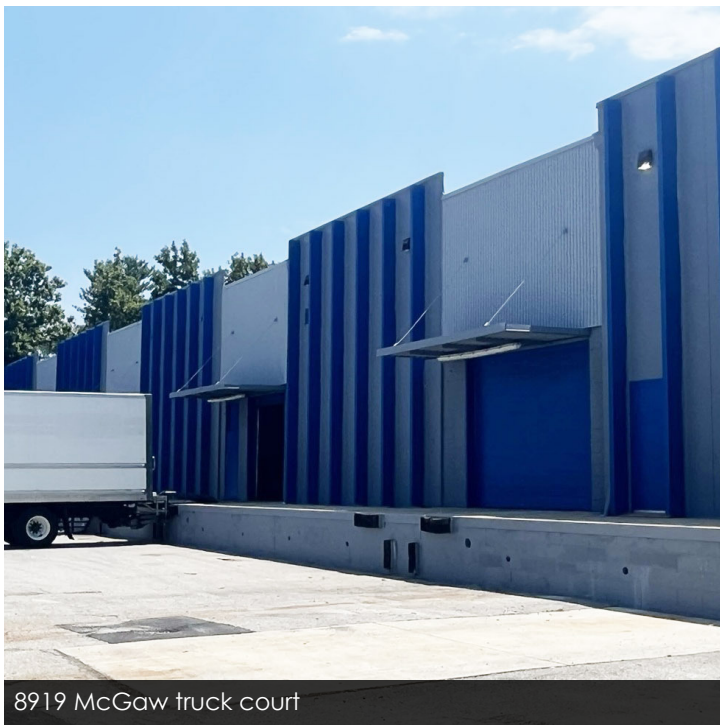
8919 McGaw truck court

Bay 7: 6,318 SF industrial space with bathroom | Bay 10-11: 12,636 SF industrial space with office and bathroom