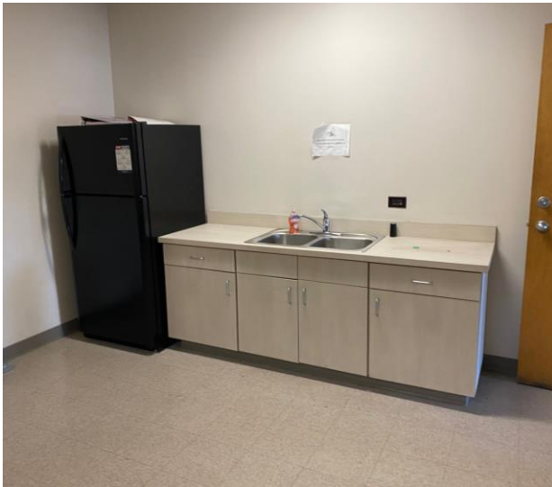
OFFICE & DOCK AREAS