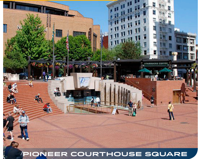
PIONEER COURTHOUSE SQUARE