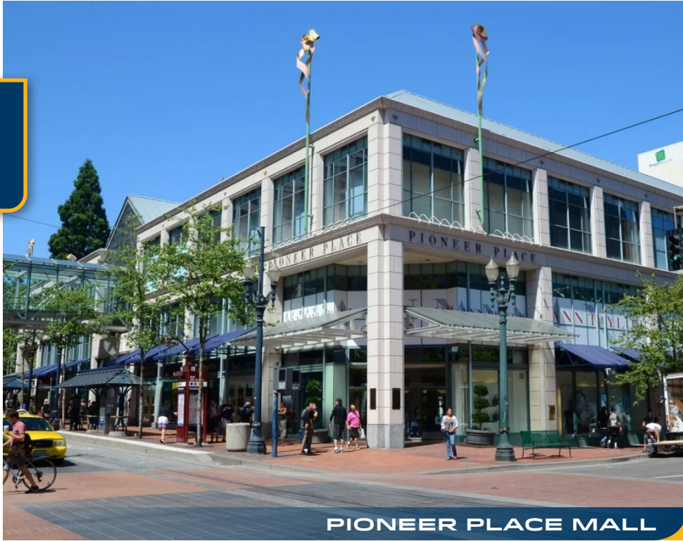
PIONEER PLACE MALL