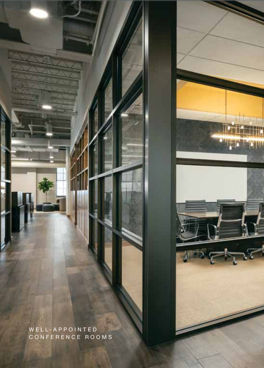
WELL-APPOINTED CONFERENCE ROOMS