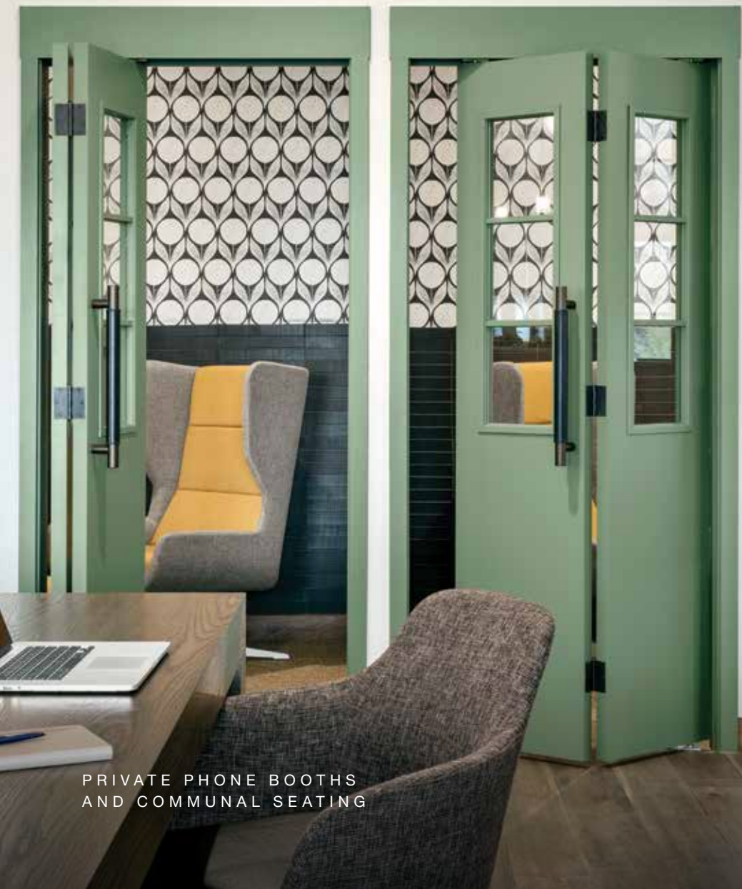
PRIVATE PHONE BOOTHS AND COMMUNAL SEATING