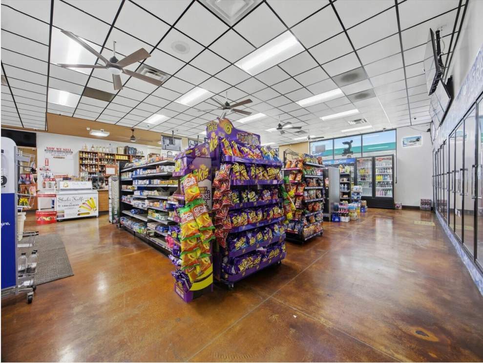
54-Illuminate Photography - 2201 S Union Ave - 31