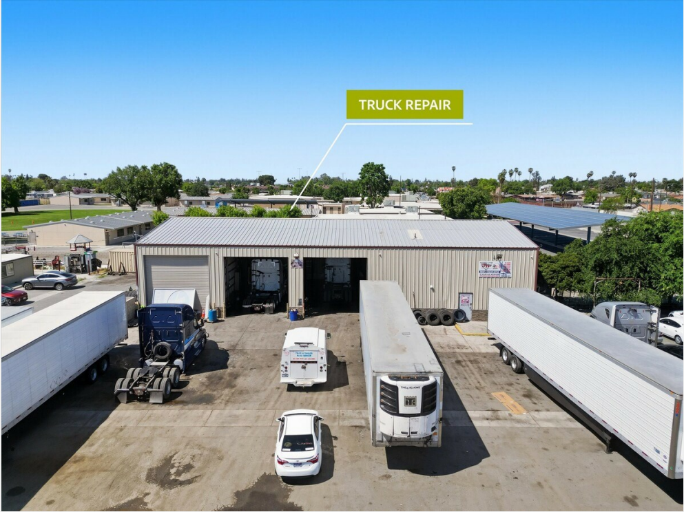
10-Illuminate Photography - G