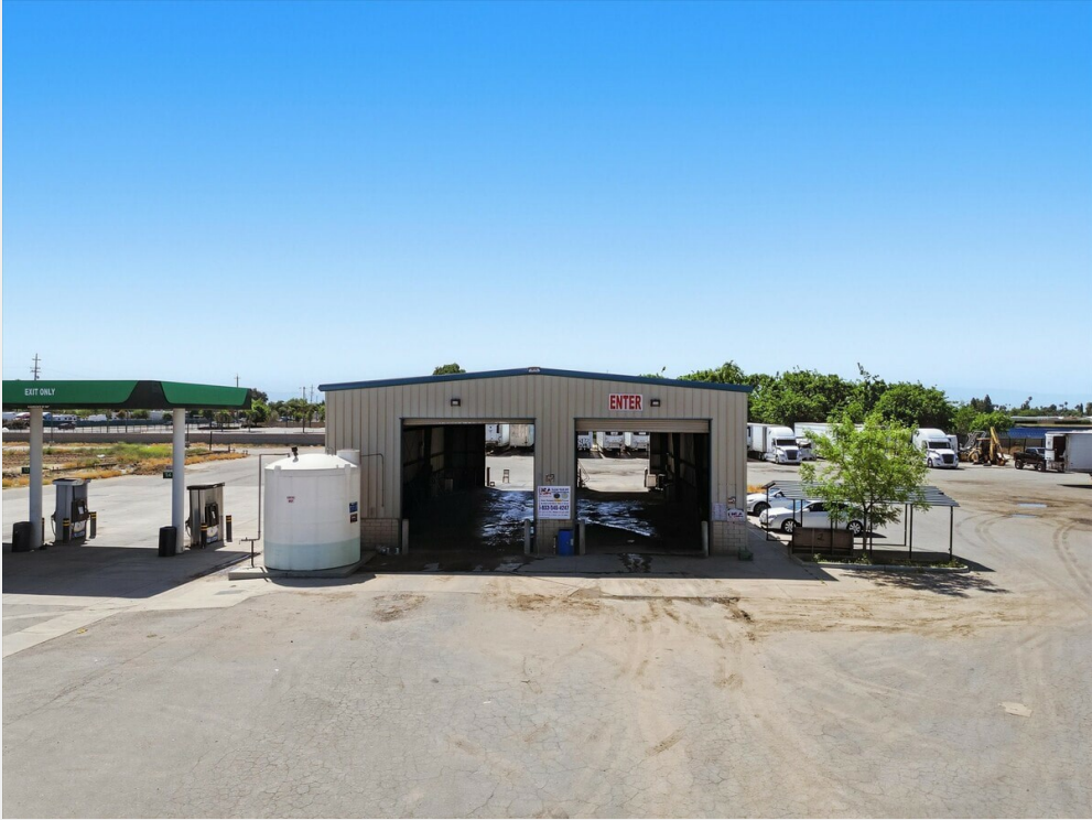
24-Illuminate Photography - 2201 S Union Ave - 17