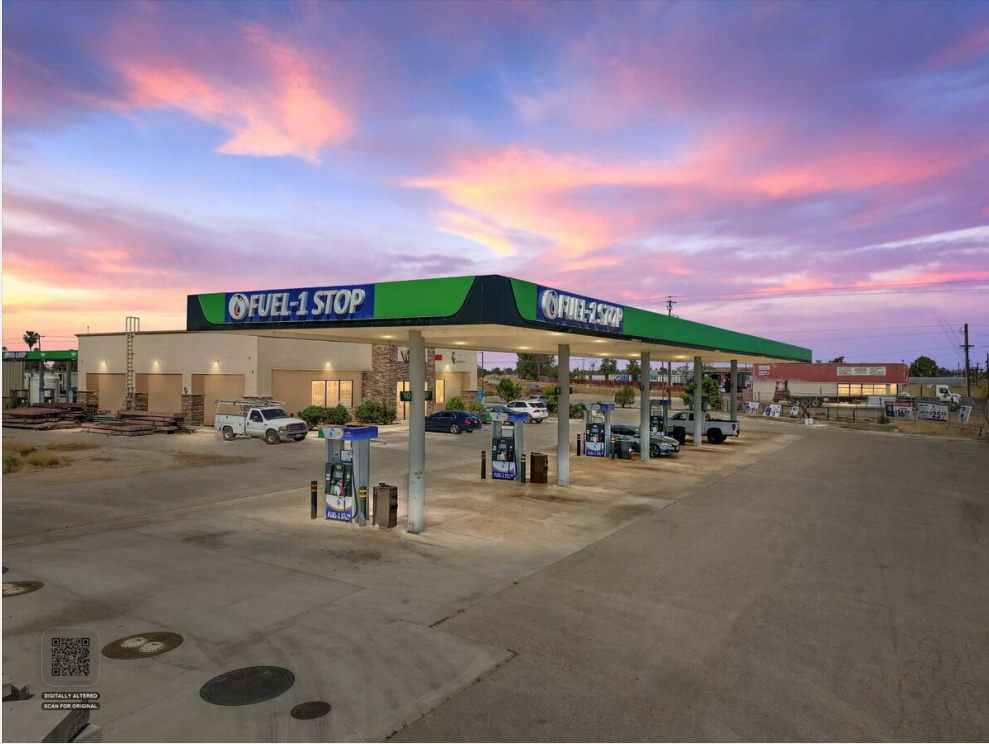
01-Illuminate Photography - 2201 S Union Ave