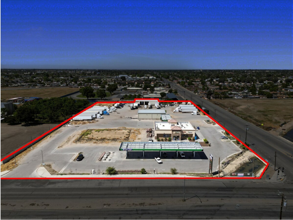
06-Illuminate Photography - B