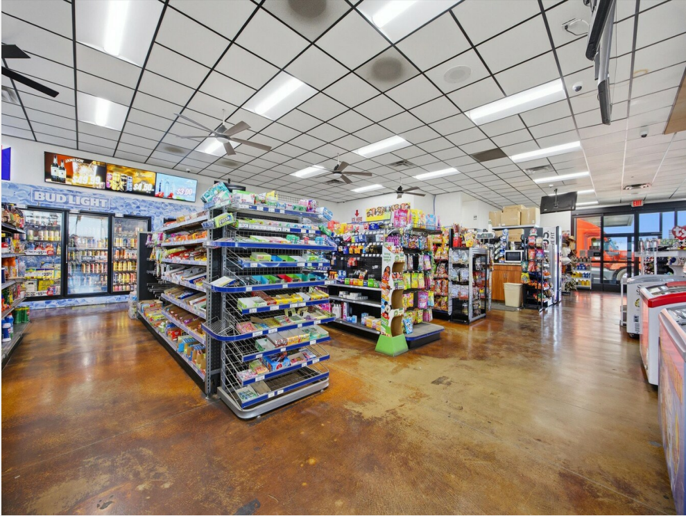
56-Illuminate Photography - 2201 S Union Ave - 35