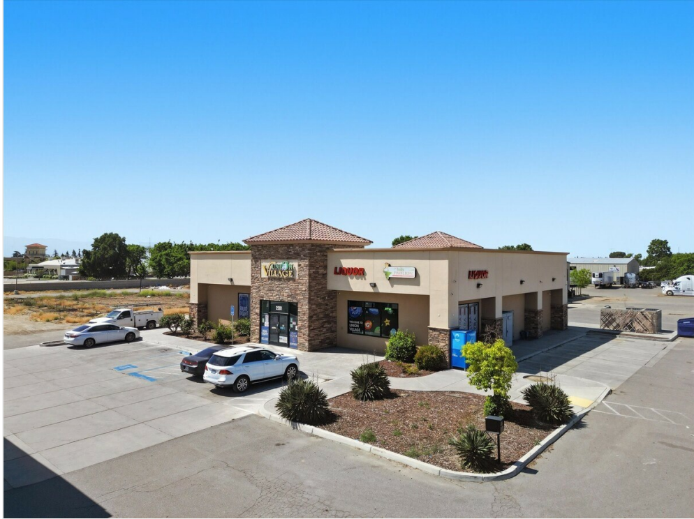
18-Illuminate Photography - 2201 S Union Ave