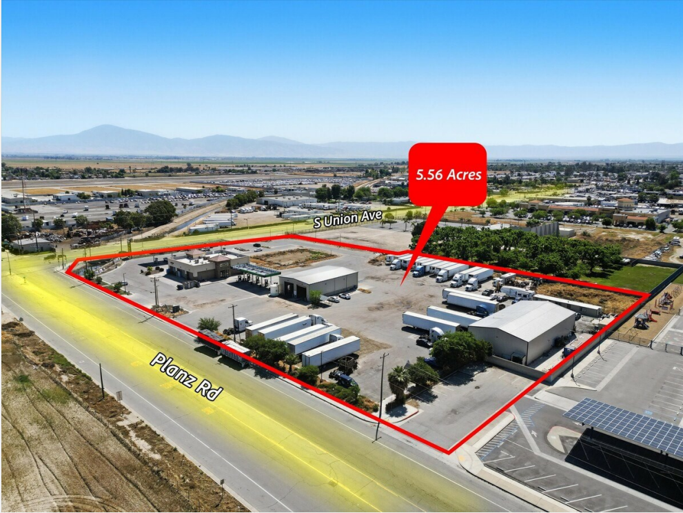
04-Illuminate Photography - C