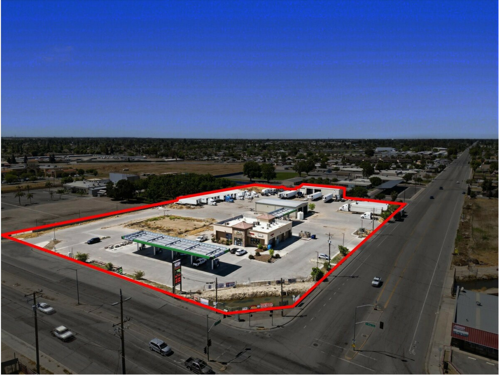
05-Illuminate Photography - D