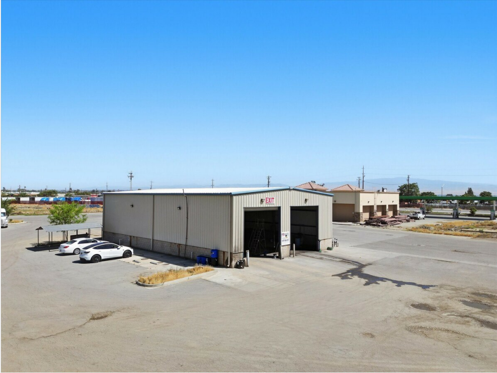
23-Illuminate Photography - 2201 S Union Ave - 13