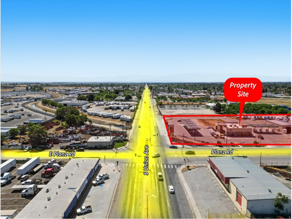
03-Illuminate Photography - A