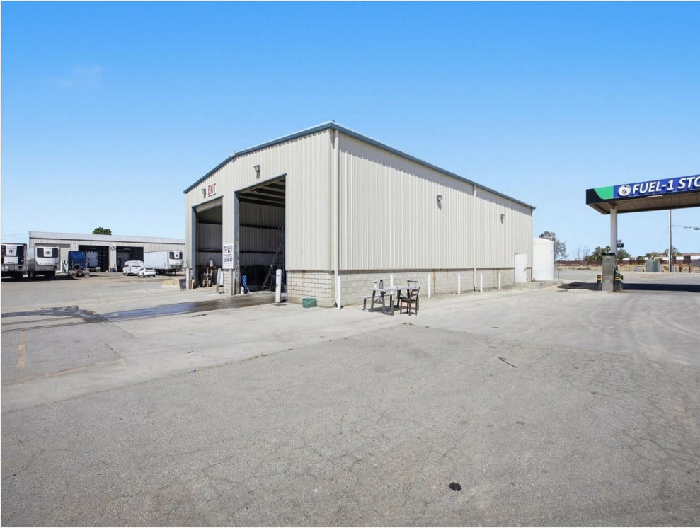
62-Illuminate Photography - 2201 S Union Ave - 43