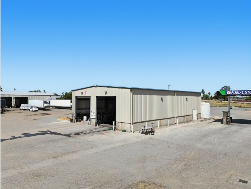
25-Illuminate Photography - 2201 S Union Ave - 15