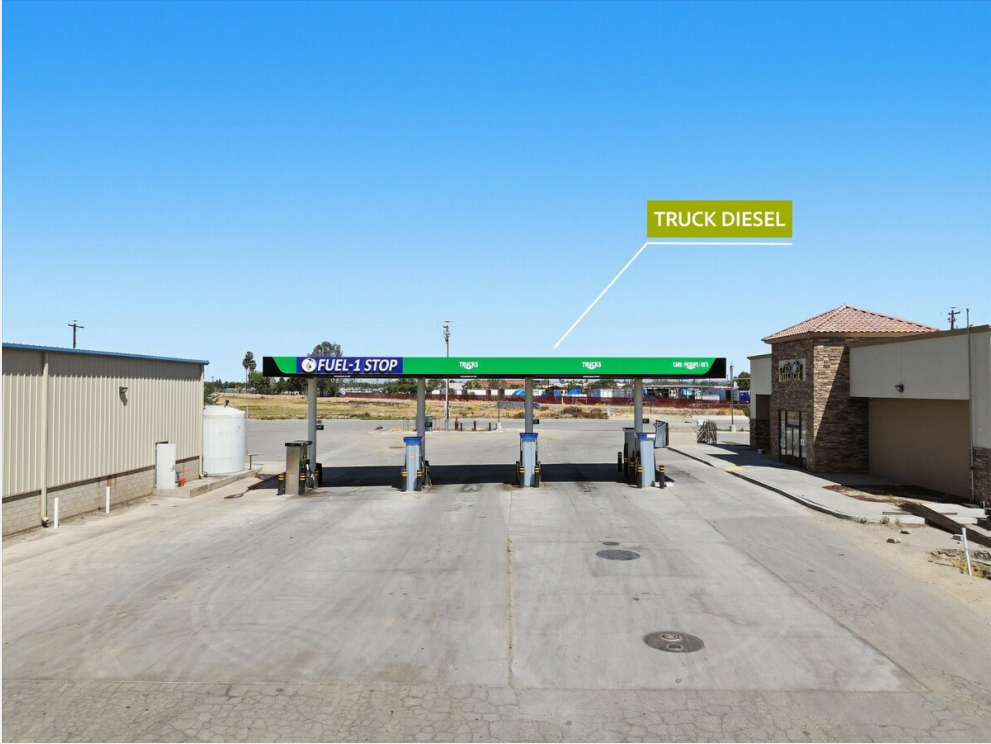
08-Illuminate Photography - F