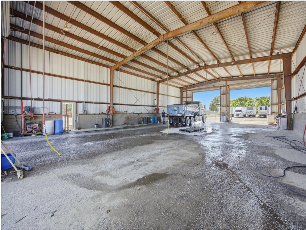
63-Illuminate Photography - 2201 S Union Ave - 51