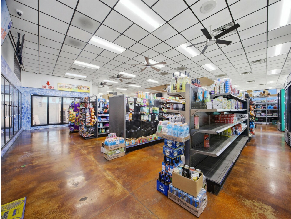
57-Illuminate Photography - 2201 S Union Ave - 32