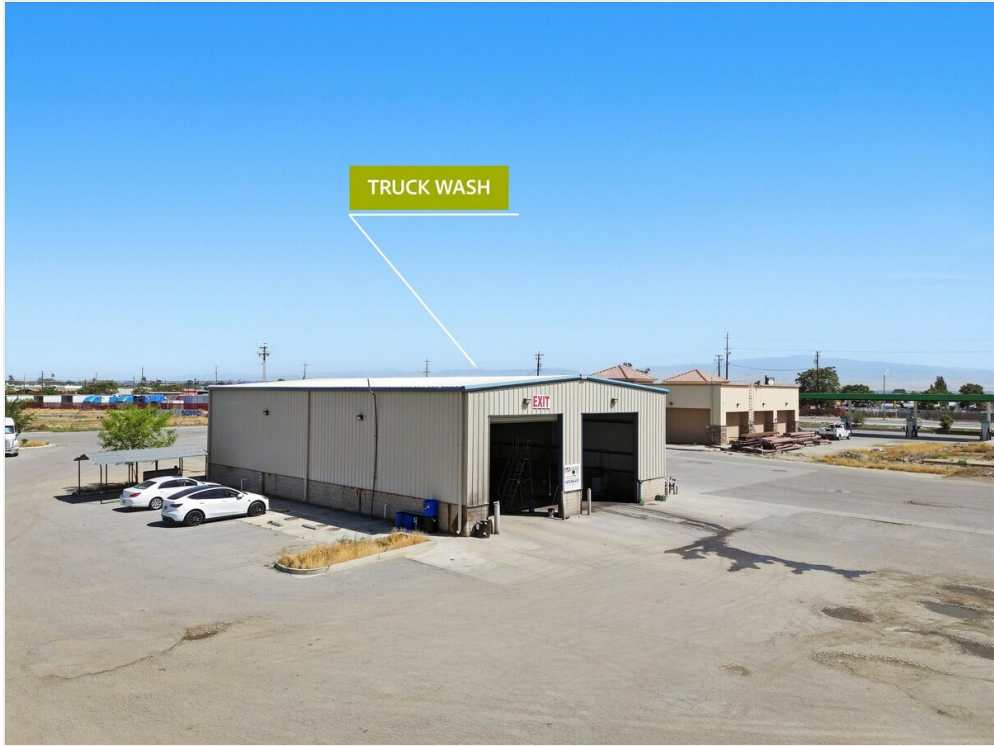
11-Illuminate Photography - J