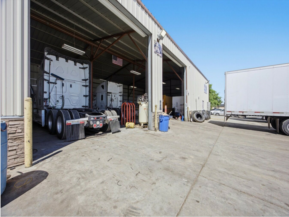
60-Illuminate Photography - 2201 S Union Ave - 50