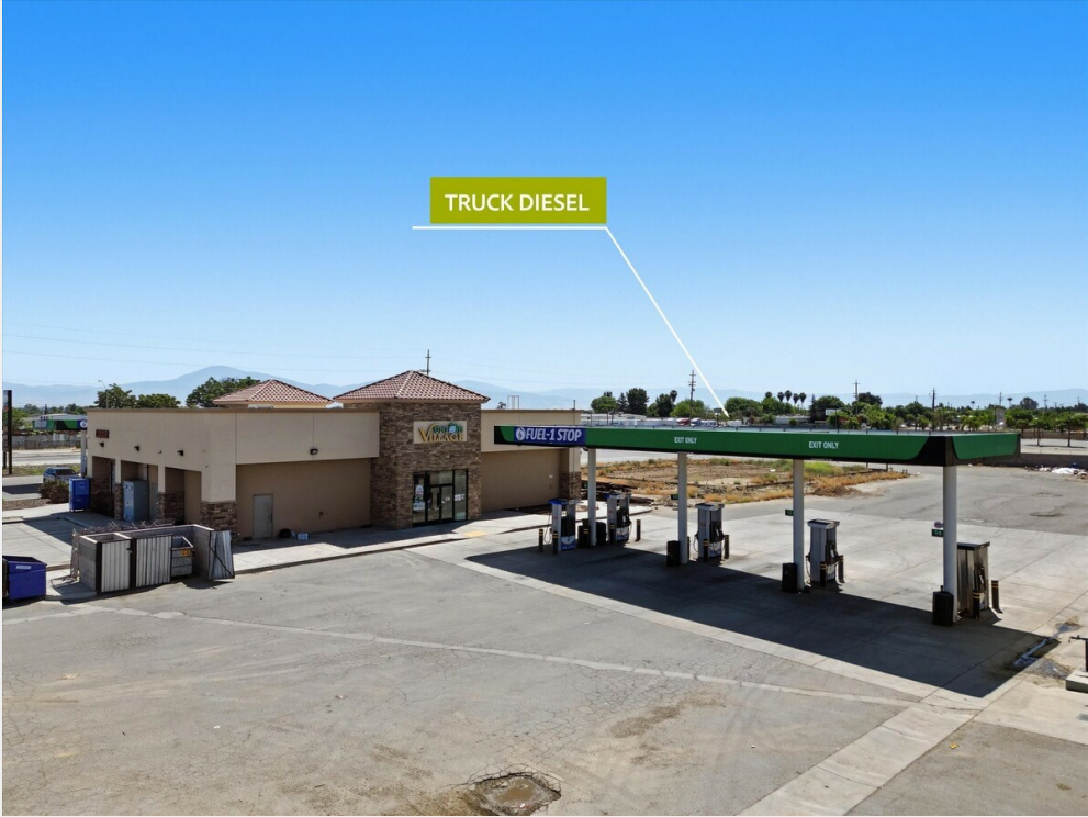
07-Illuminate Photography - E