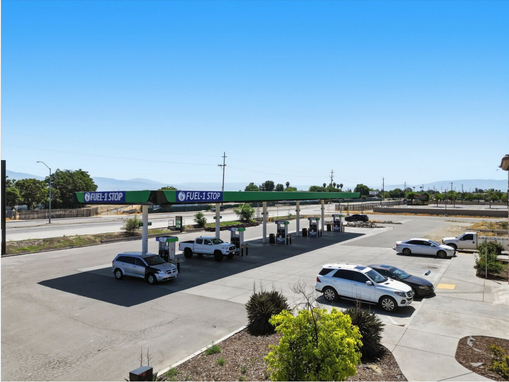
17-Illuminate Photography - 2201 S Union Ave - 19