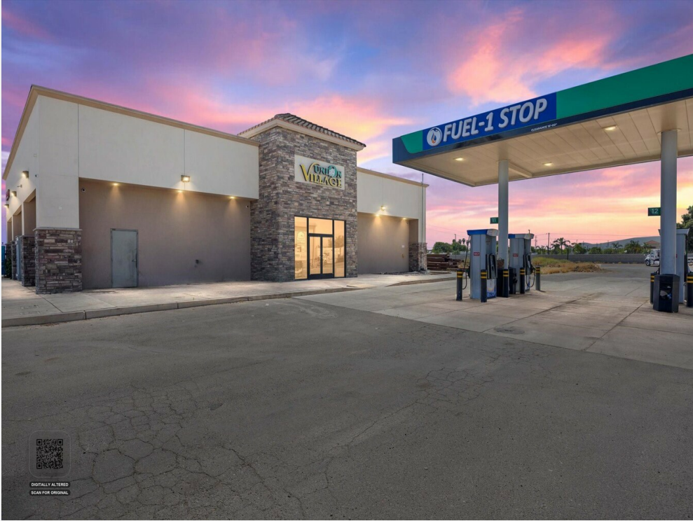
02-Illuminate Photography - 2201 S Union Ave