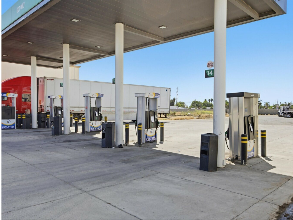
40-Illuminate Photography - 2201 S Union Ave - 41