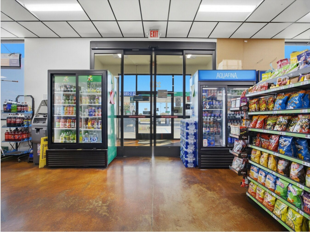
53-Illuminate Photography - 2201 S Union Ave - 33