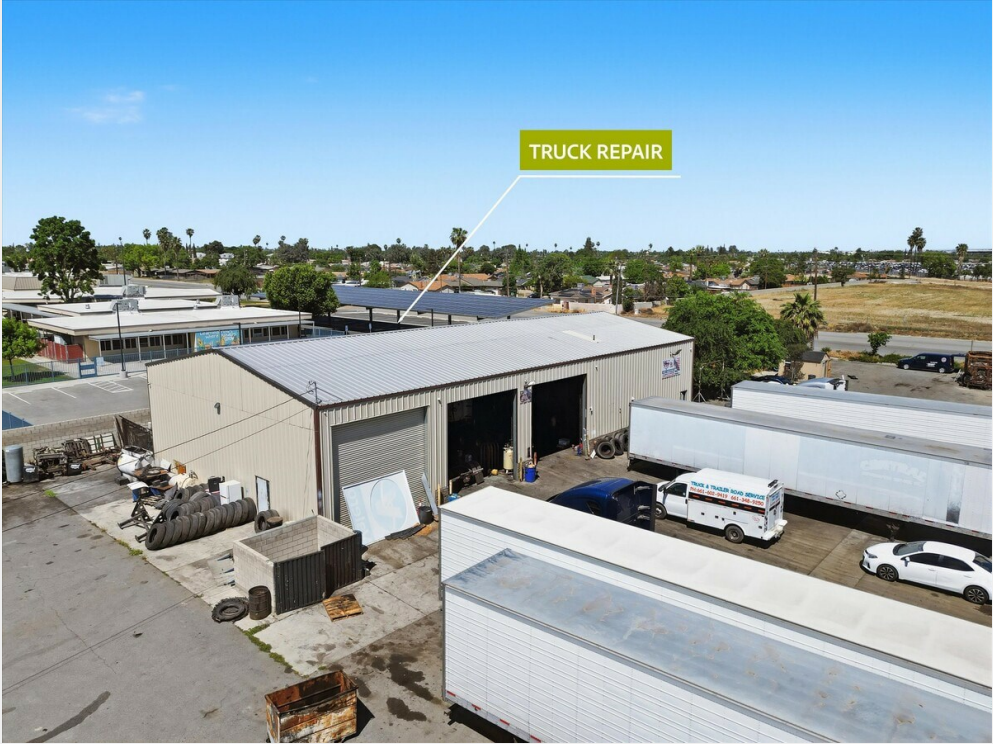
09-Illuminate Photography - H