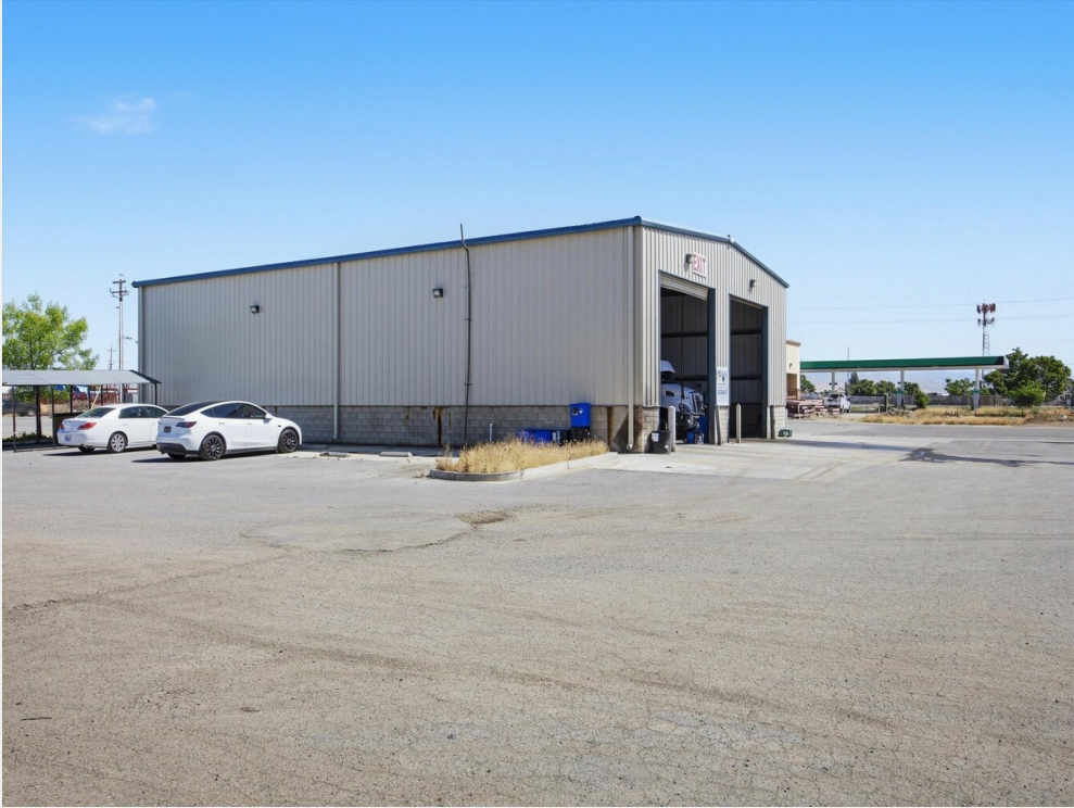
59-Illuminate Photography - 2201 S Union Ave - 48