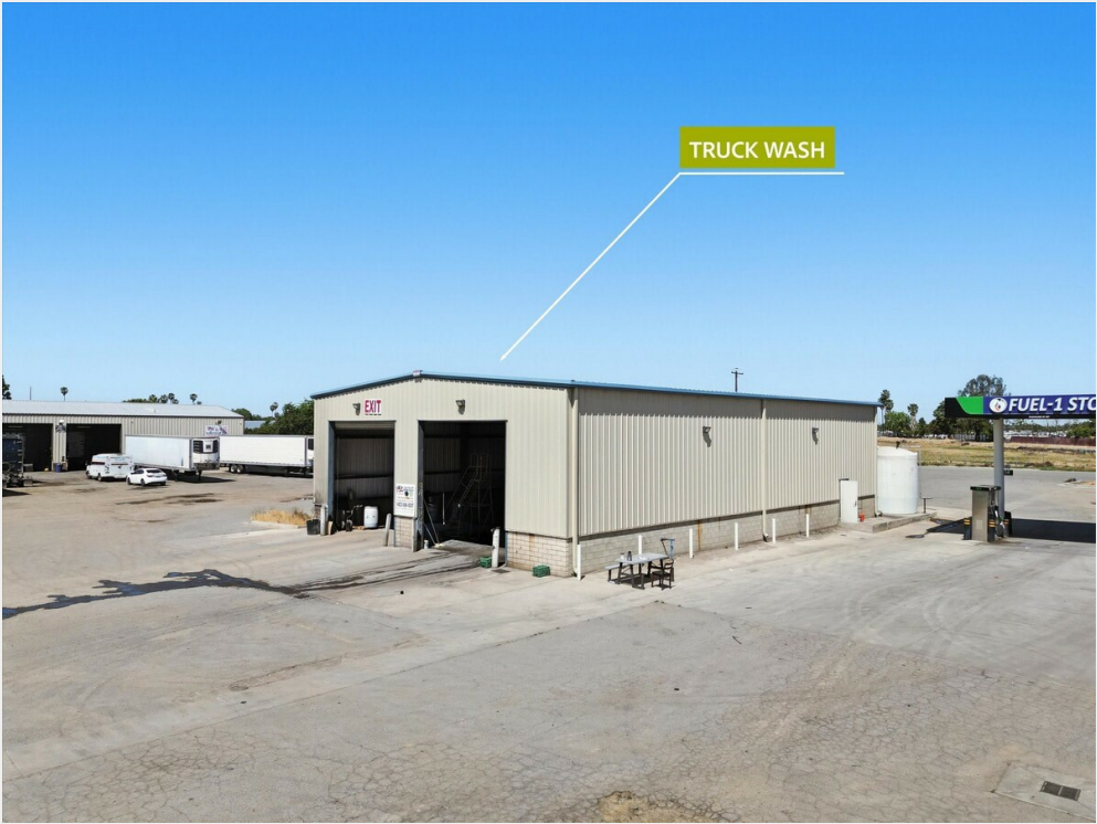
12-Illuminate Photography - I