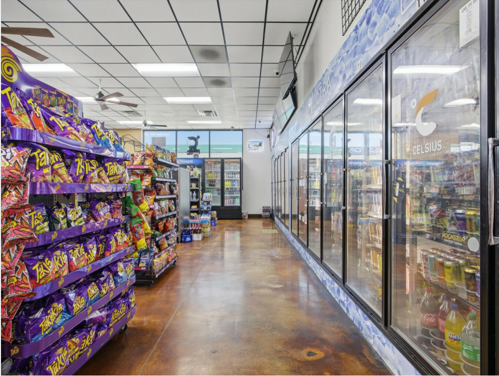
55-Illuminate Photography - 2201 S Union Ave - 30