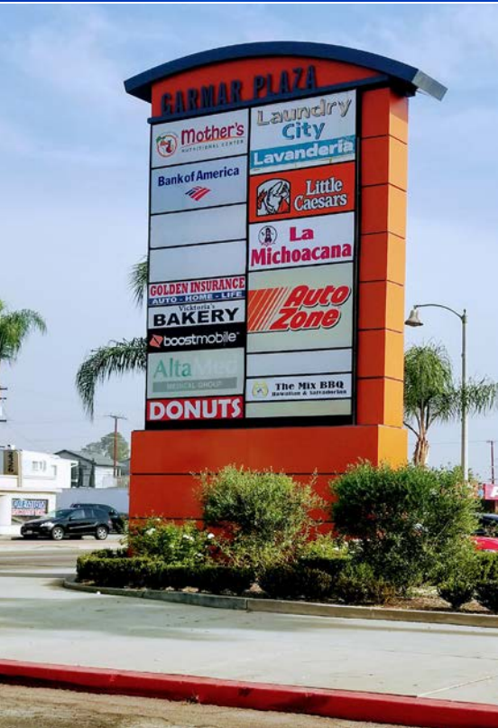
Pylon Signage Availability

UNIT 2313: 3,645 Sq. Ft. Large Open Space Large Open Space and Restrooms.