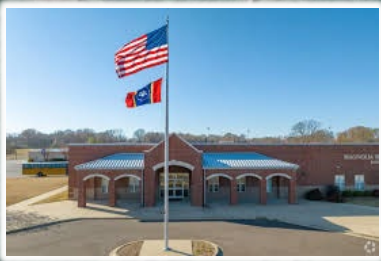
Magnolia Heights School