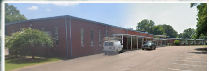
Senatobia Optional Learning School