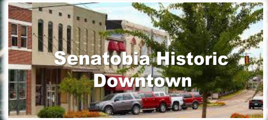
Senatobia Historic Downtown