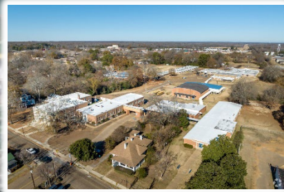
Senatobia Junior | High School