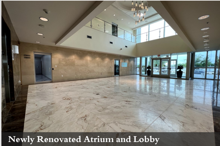
Newly Renovated Atrium and Lobby

209 State Highway 121 Bypass Lewisville, TX 75067