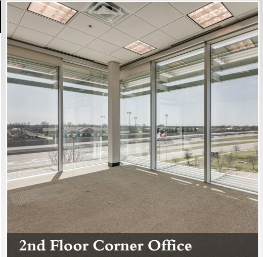
2nd Floor Corner Office