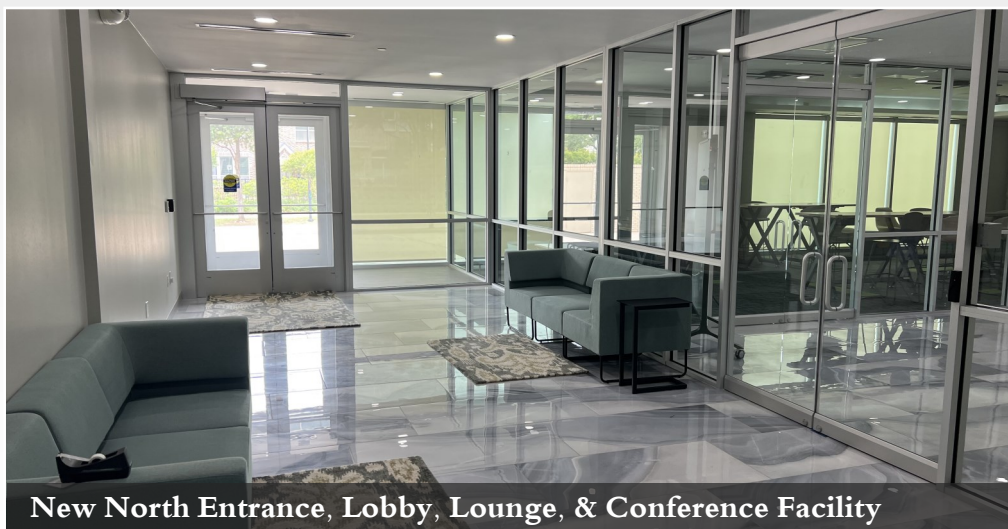
New North Entrance, Lobby, Lounge, & Conference Facility