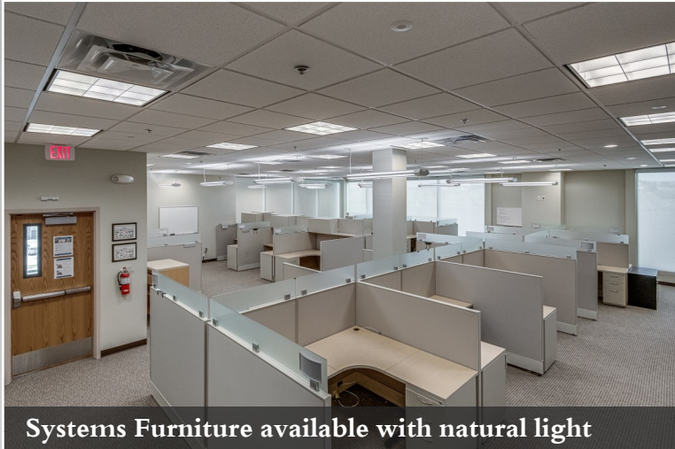
Systems Furniture available with natural light

209 State Highway 121 Bypass Lewisville, TX 75067