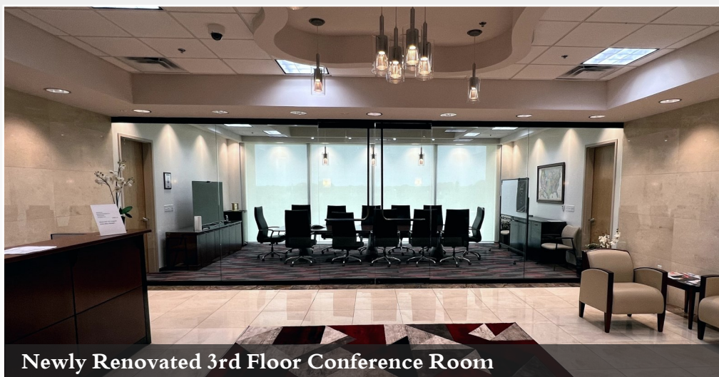
Newly Renovated 3rd Floor Conference Room