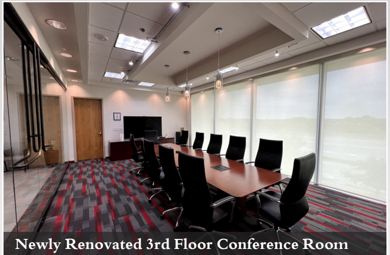
Newly Renovated 3rd Floor Conference Room