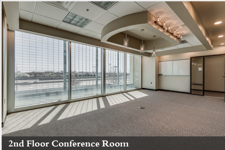
2nd Floor Conference Room