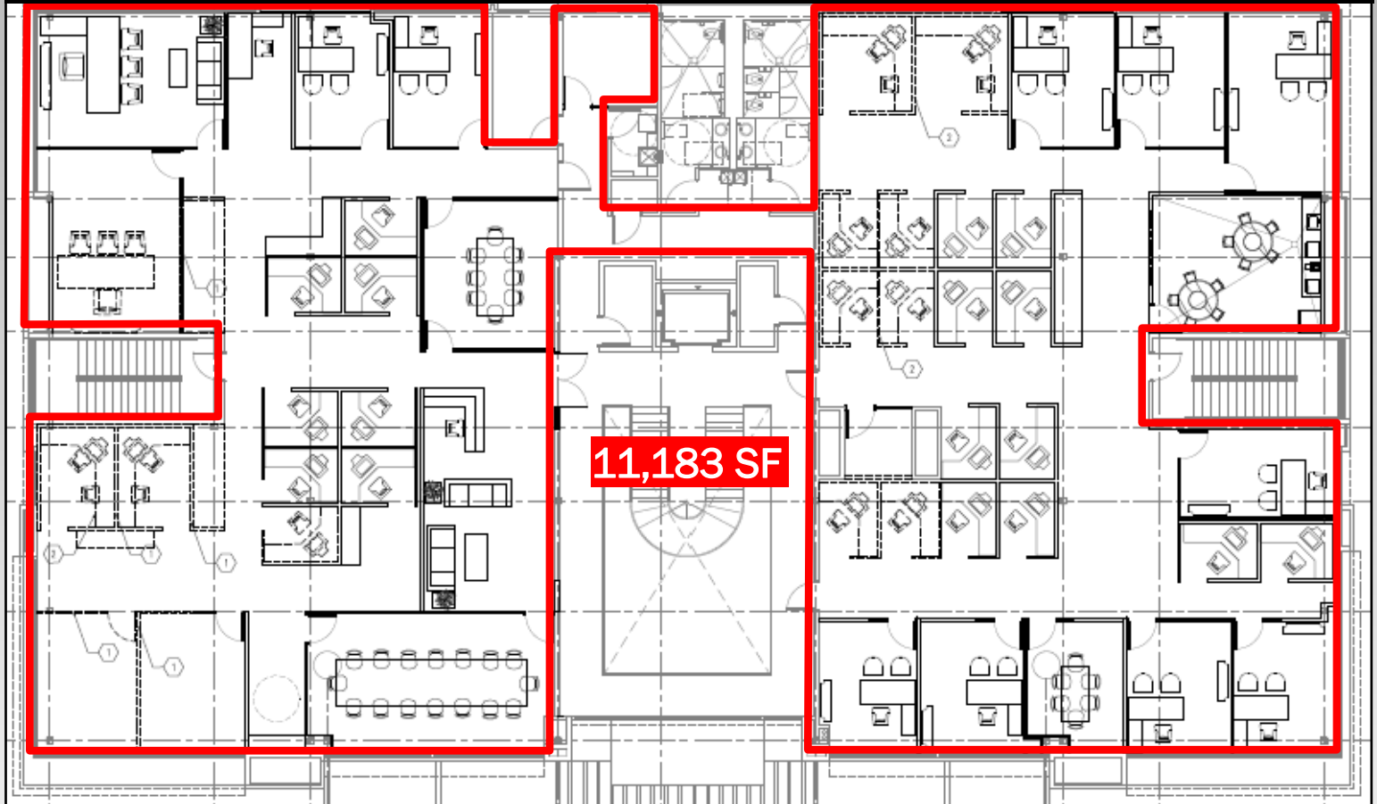
SECOND FLOOR PLAN - 11,183 SF

209 State Highway 121 Bypass Lewisville, TX 75067