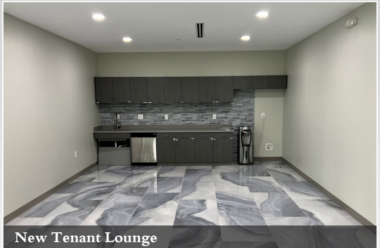
New Tenant Lounge