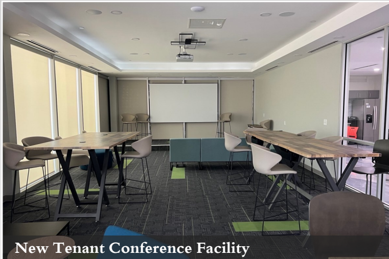
New Tenant Conference Facility