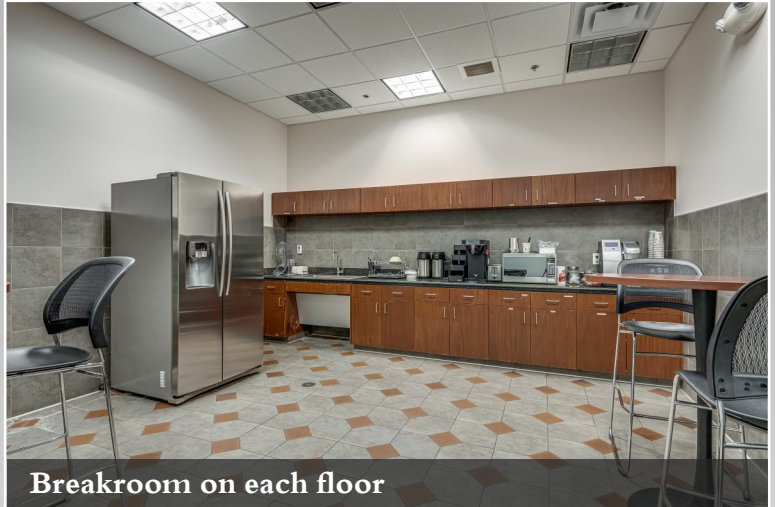
Breakroom on each floor