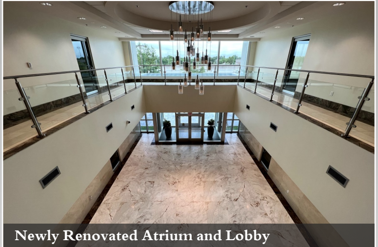
Newly Renovated Atrium and Lobby