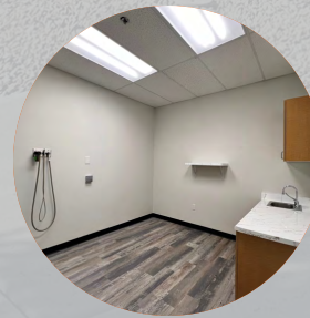
Expansive Treatment Areas