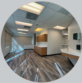
Flexible Floor Configuration