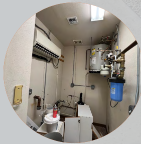
Pre Plumbed for O2 and N2O