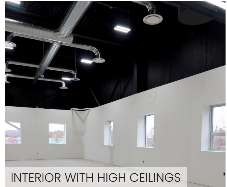
INTERIOR WITH HIGH CEILINGS