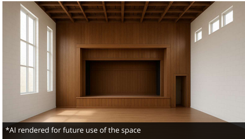
*AI rendered for future use of the space