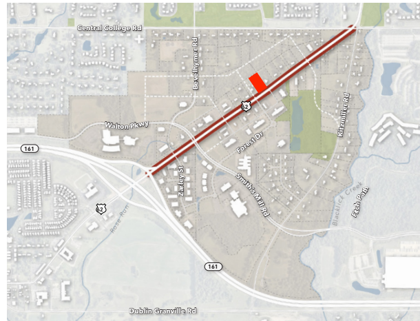
Primary US-62 Street Section

The supporting diagram below is intended to serve as general guidance. Pending engineering studies will determine appropriate streetscape elements and dimensions. This section aims to match recent improvements to other segments of US-62.