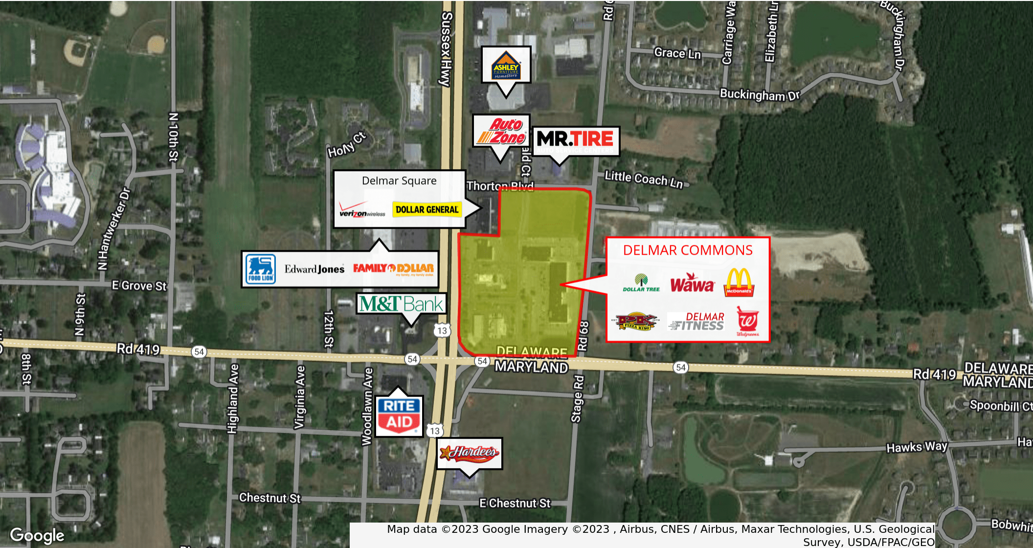
Map data ©2023 Google Imagery ©2023 , Airbus, CNES / Airbus, Maxar Technologies, U.S. Geological Survey, USDA/FPAC/GEO