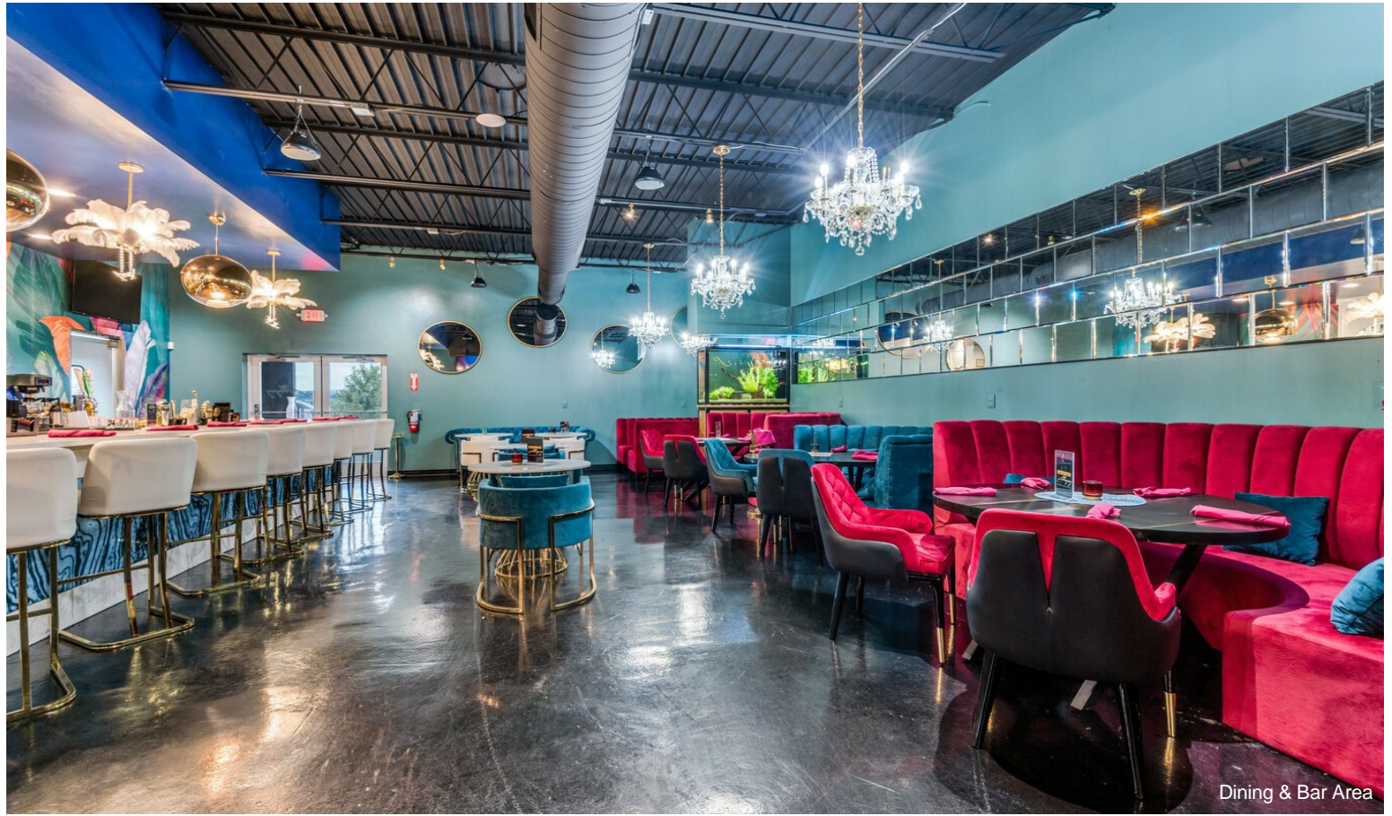
Dining & Bar Area