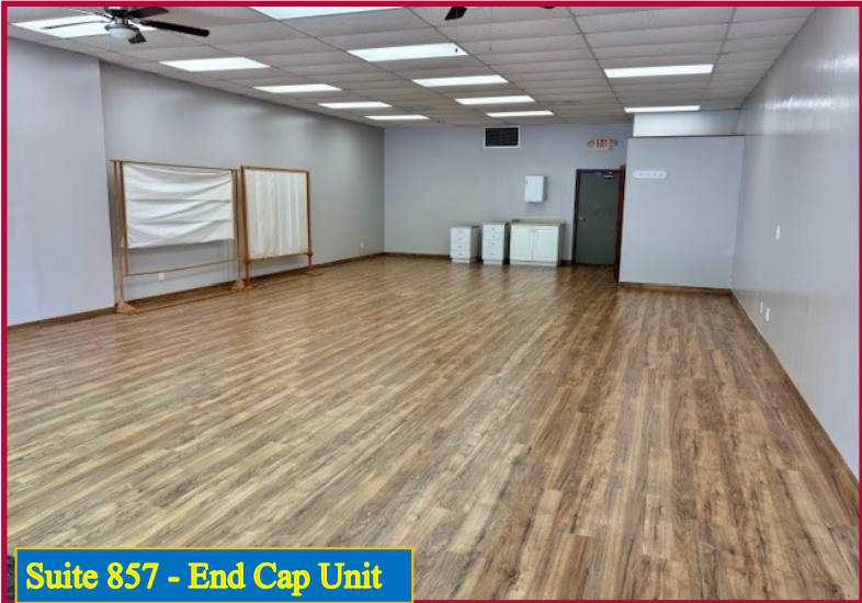
Suite 857 - End Cap Unit