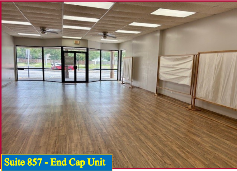
Suite 857 - End Cap Unit