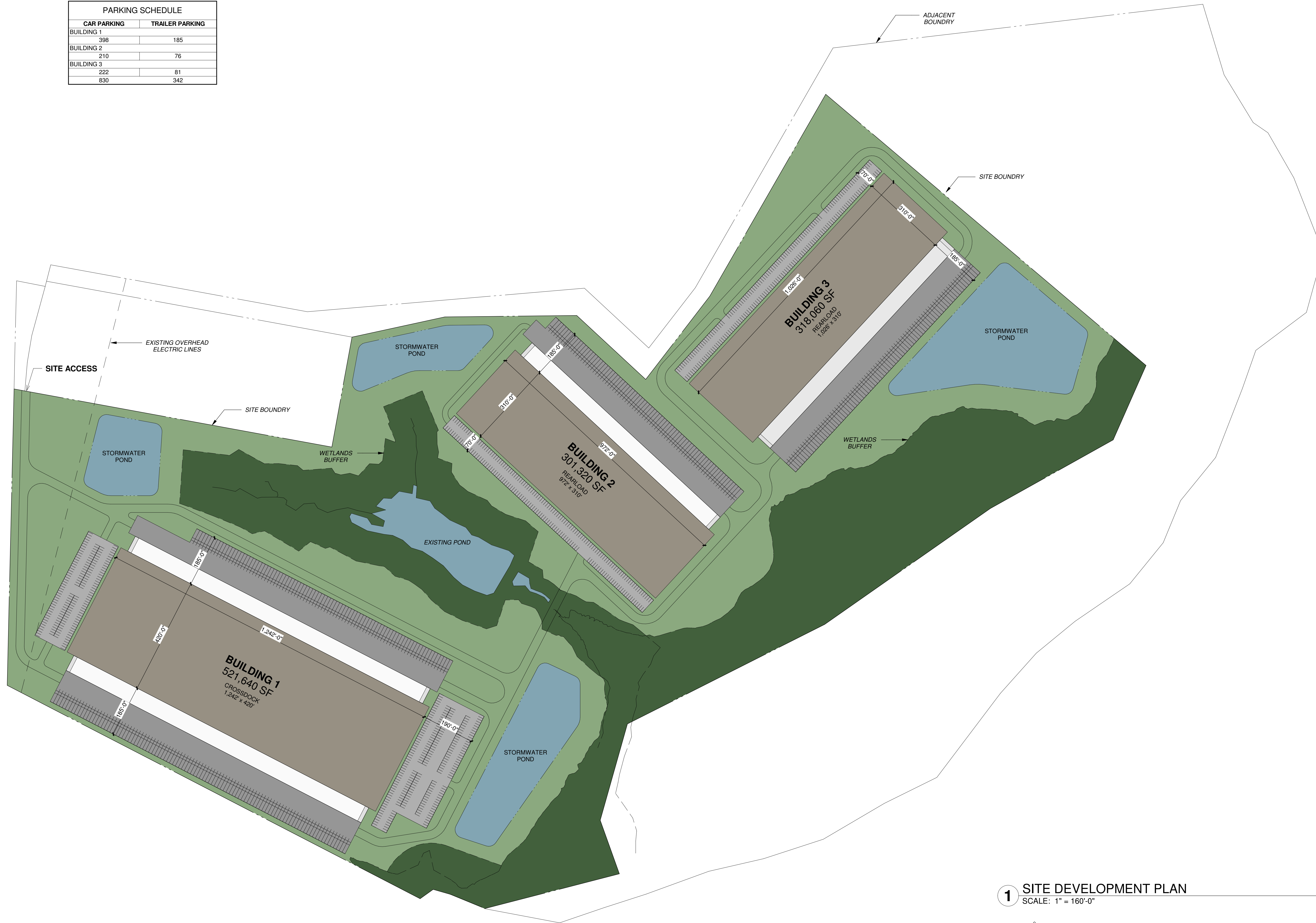
1 SITE DEVELOPMENT PLAN SCALE: 1" = 160'-0"

ADB | DESIGN SERVICES 380 Interstate North Pkwy, SE, Atlanta, GA 30339 Suite 210 770.541.1700