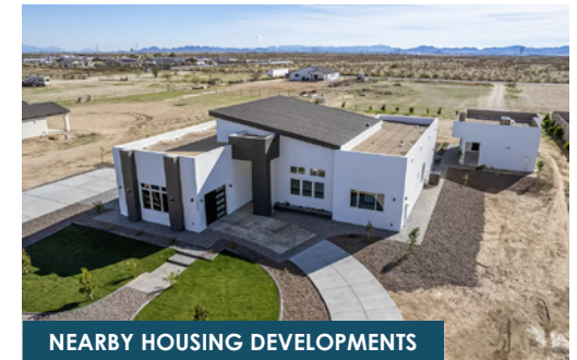
NEARBY HOUSING DEVELOPMENTS