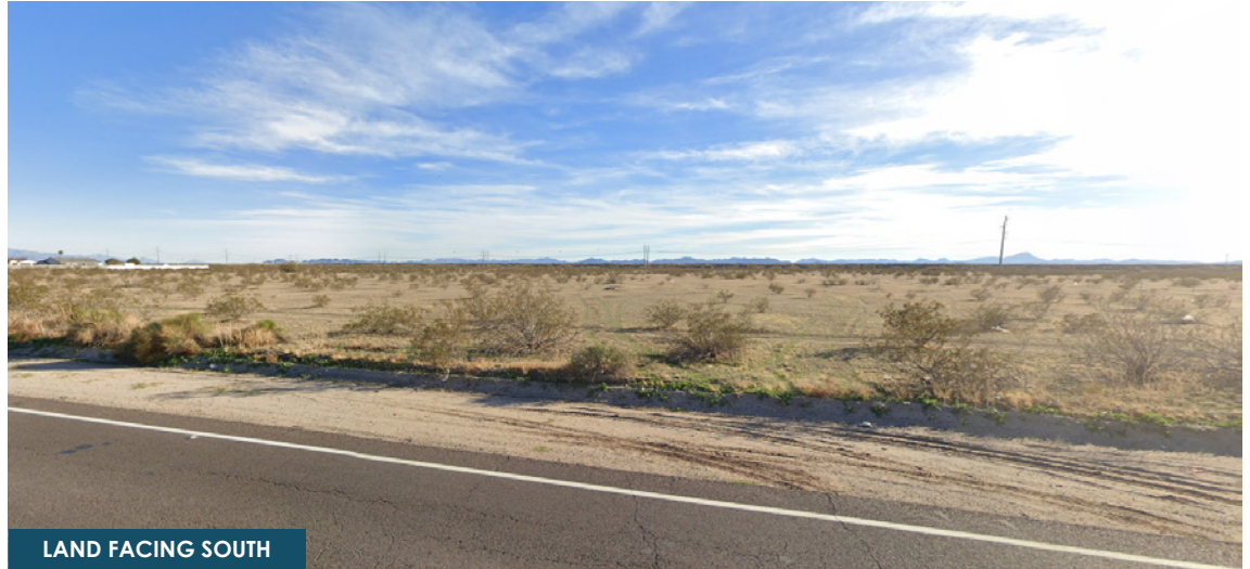
LAND FACING SOUTH