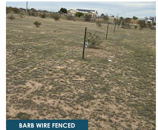
BARB WIRE FENCED