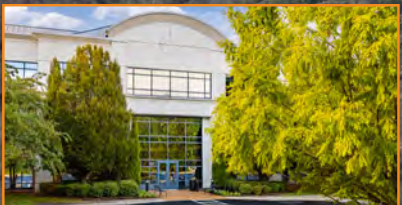
PETER JEFFERSON PLACE VII 652 Peter Jefferson Pkwy