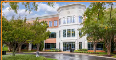
PETER JEFFERSON PLACE II 630 Peter Jefferson Pkwy