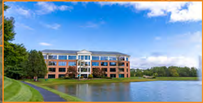
PETER JEFFERSON PLACE I 675 Peter Jefferson Pkwy