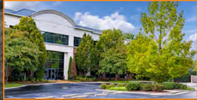
PETER JEFFERSON PLACE VI 650 Peter Jefferson Pkwy