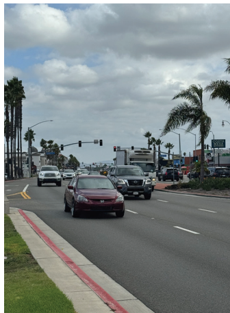
SOUTH BOUND TRAFFIC ON NEWPORT BLVD