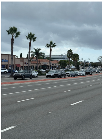
NORTH BOUND TRAFFIC ON NEWPORT BLVD