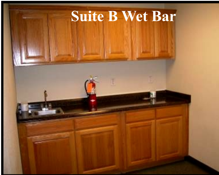
Suite B Wet Bar