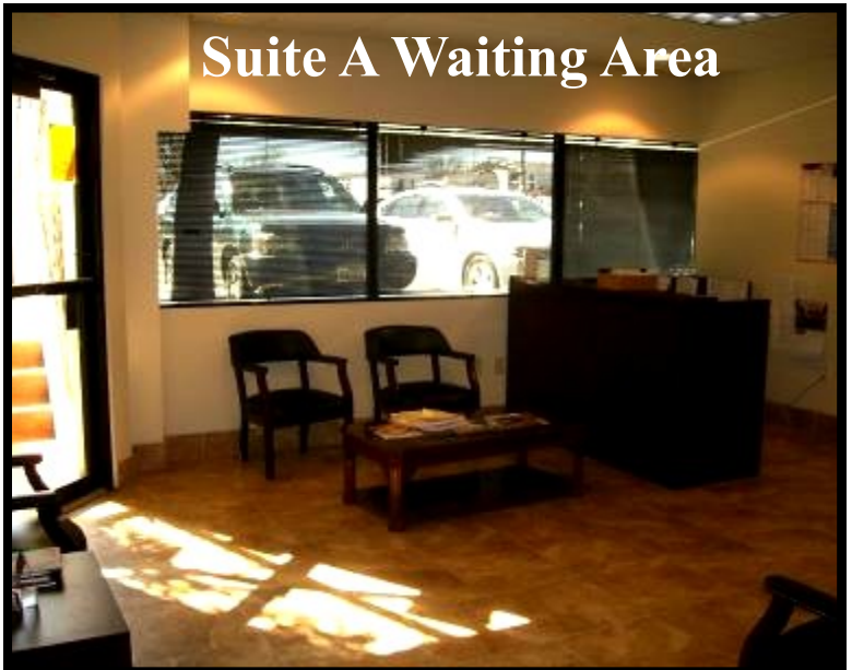
Suite A Waiting Area