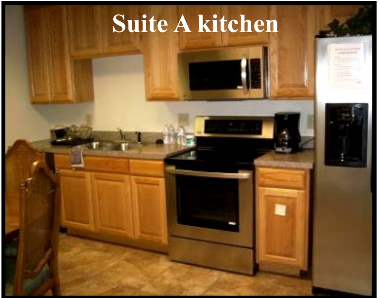
Suite A kitchen