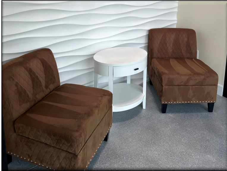
Common entry/waiting area

COLDWELL BANKER COMMERCIAL VALLEY REALTY