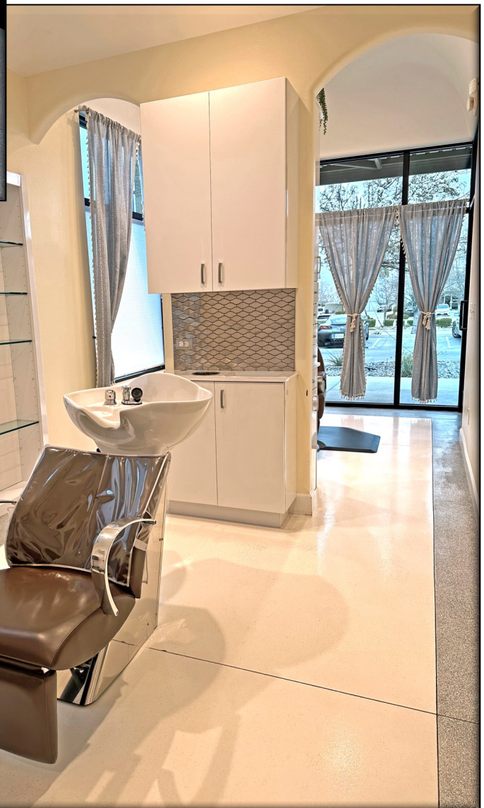
Abundant natural lighting