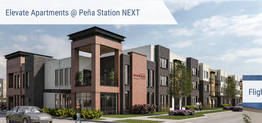
Elevate Apartments @ Peña Station NEXT