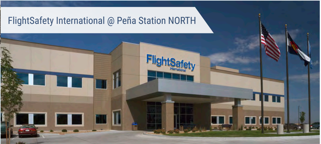
FlightSafety International @ Peña Station NORTH