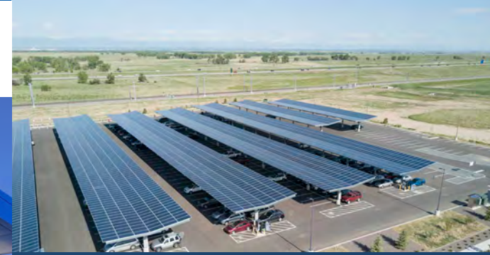
SOLAR PARKING CANOPY