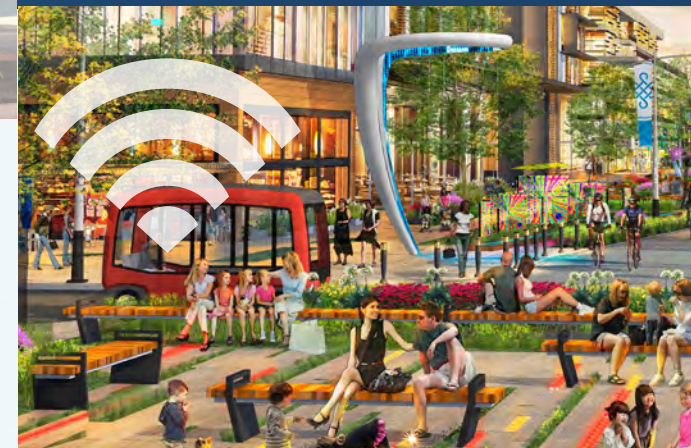
COMMUNITY WIFI @ PEÑA STATION NEXT