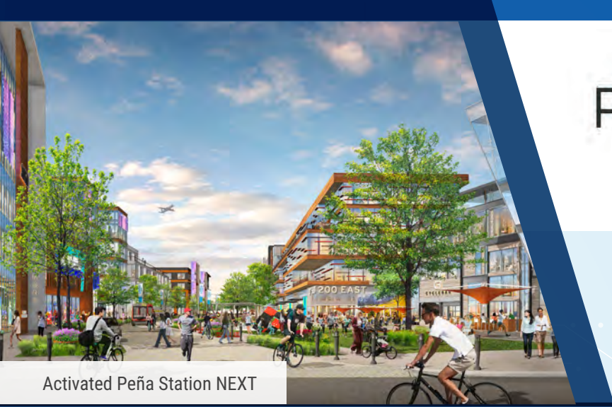
Activated Peña Station NEXT