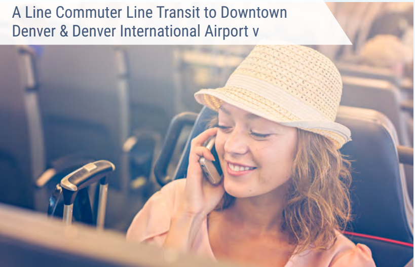
A Line Commuter Line Transit to Downtown Denver & Denver International Airport v