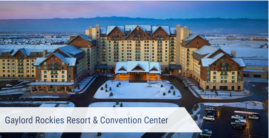
Gaylord Rockies Resort & Convention Center