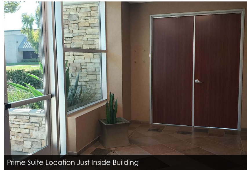
Prime Suite Location Just Inside Building