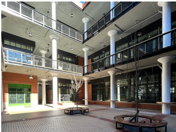
THE THREAD | ROCK HILL, SC