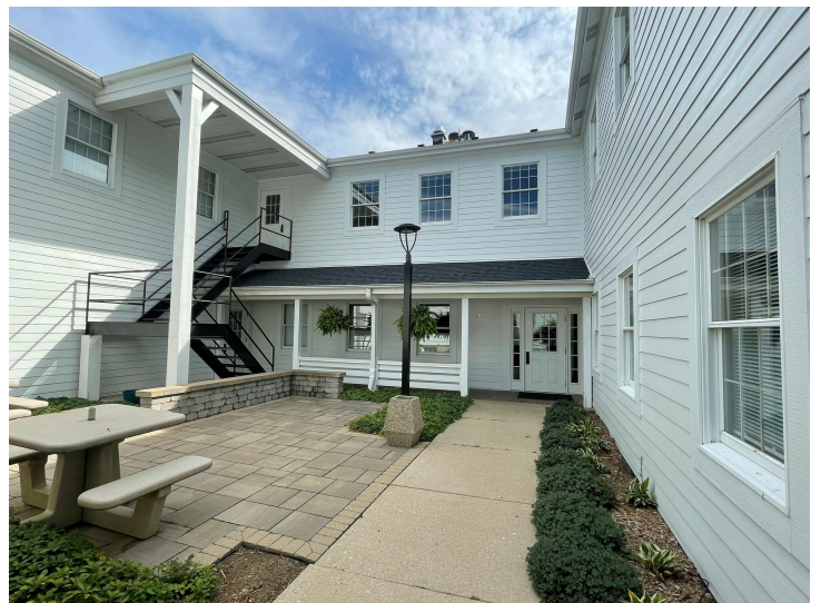
Courtyard with picnic tables