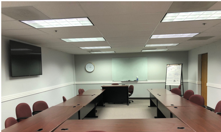
Conference Room 1 of 2