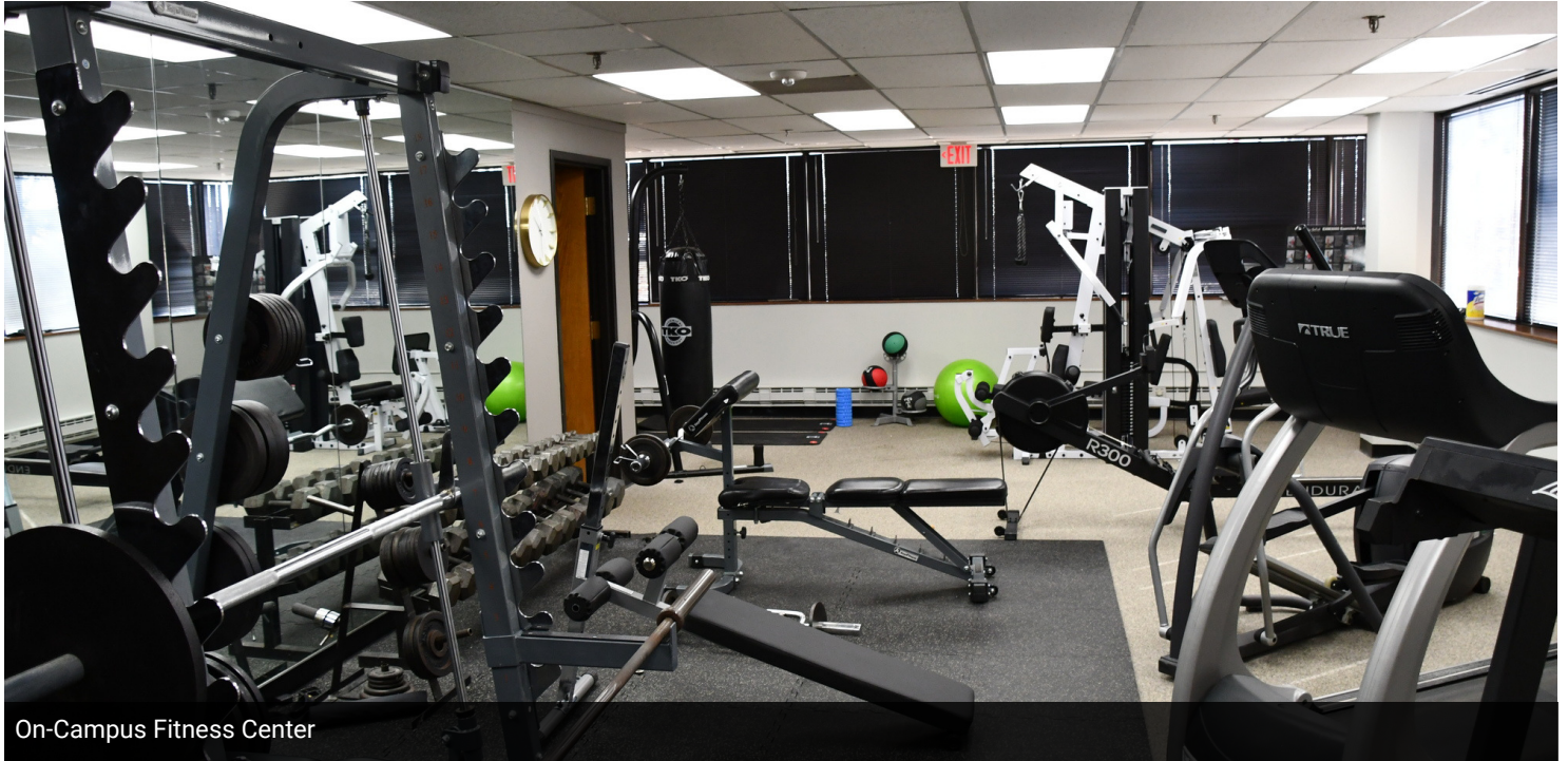
On-Campus Fitness Center