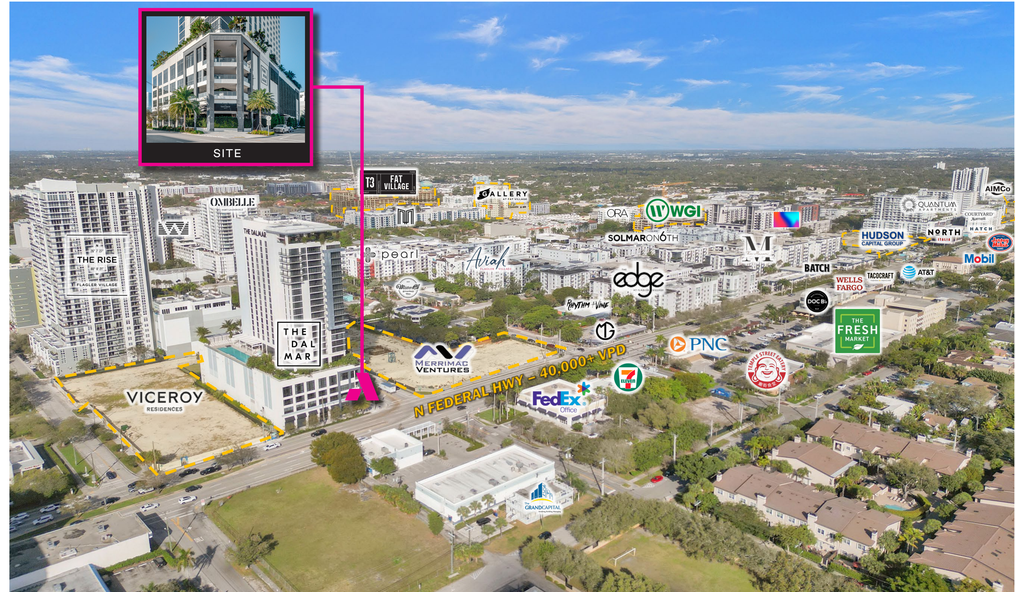
AERIAL - NORTHWEST