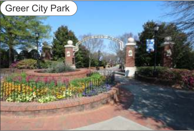
Greer City Park