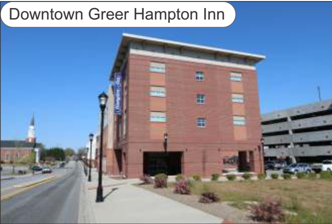
Downtown Greer Hampton Inn