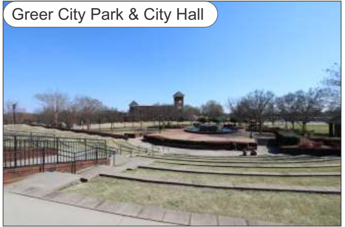
Greer City Park & City Hall