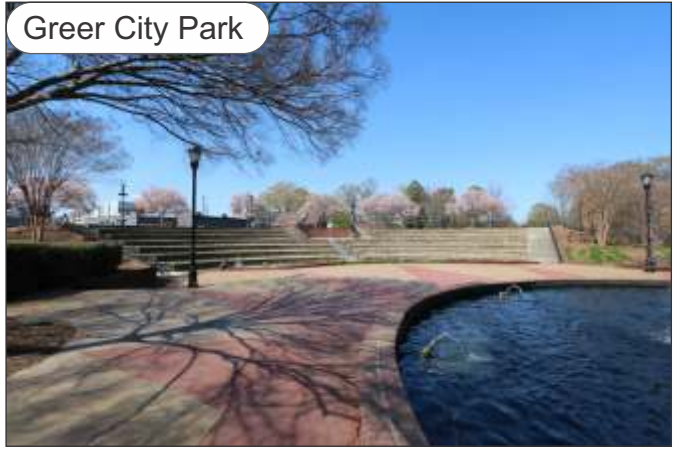
Greer City Park